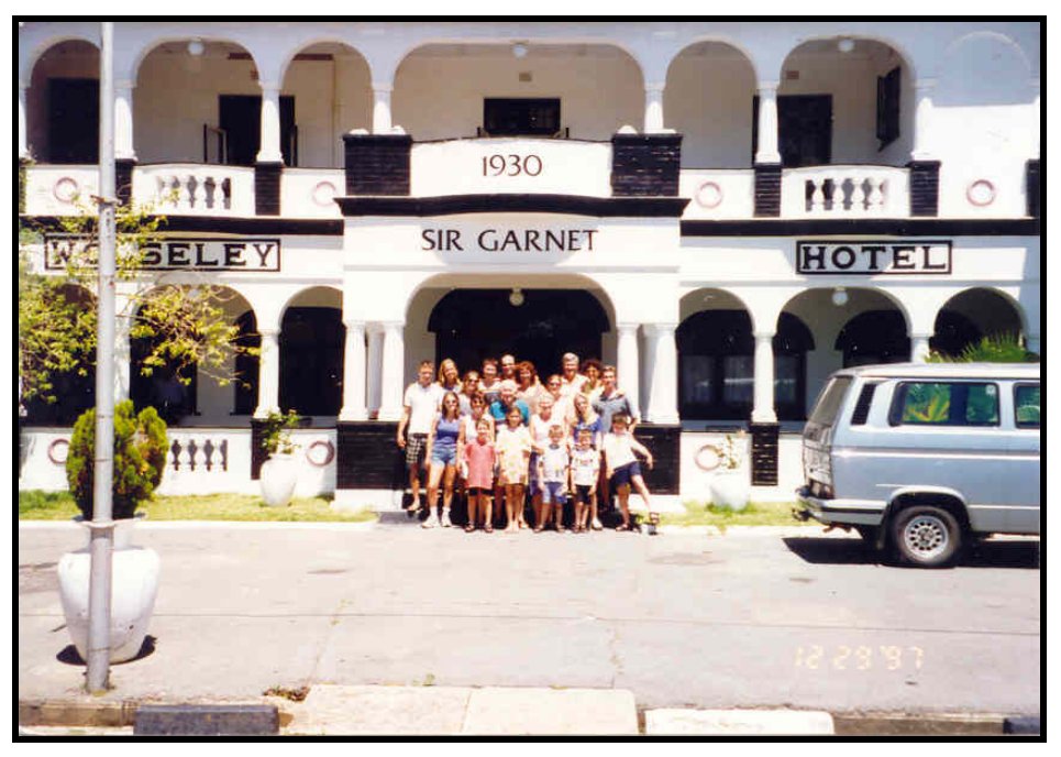
Katzenellenbogen/Batten family reunion outside the Wolseley Hotel in 1997