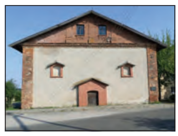
Quaint former synagogue in the village of Krakenava (Krakinova). The section of its plaque reads Do iz geven der Besmedresh – 'Here was the synagogue'.

of Pusalotas has a more extensive inscription: "In memory of Pushelat Jews who lived and worked for centuries in peace with their neighbours, and those who were uprooted and murdered by the Nazi murderers and their accomplices in 1941. May their memory be for a blessing."