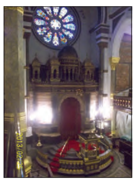
Interior New West End Synagogue, London