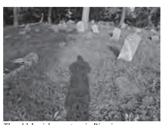
The old Jewish cemetery in Birzai.

East of the centre and across the river is a neighbourhood of older wooden and more recent brick houses with luscious gardens full of flowers and fruit trees, facing the lake. Perhaps this in former times was home to some of the town's many Jews, as the ancient Jewish cemetery of Biržai is to be found at its extremity, on a headland extending out into the lake. The many gravestones there have been worn away by time and the elements. In August 2013, a field school was held in Jewish Ethnography and Epigraphics by SEFER, the Moscow Centre for University Teaching of Jewish Civilization<sup>29</sup>, and inscriptions on the gravestones were recorded. An image comes to mind of my grandfather as a child playing along the lakeshore, revelling in the beauty of the place; he spent his last years living in a house on Queen's Road in Sea Point, a road perpendicular to the sea, similar to the way the roads in this neighbourhood run down to the lake. It made me wonder if any connection ever entered his mind, given the difference in magnitude between the Atlantic Ocean and little Širvėna Lake.