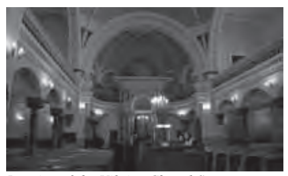
Interior of the Vilnius Choral Synagogue

Immediately after the Nazi invasion in June 1941, the mass murder of the Jewish population began at a site in the forest at Paneriai, a suburb of Vilnius. A total of 70 000 Lithuanian and Polish Jews perished there, shot and buried in mass graves. All in all, nearly 95% of a population of approximately 210 000 were murdered, making Lithuania one of the countries where the Final Solution was most effectively implemented.