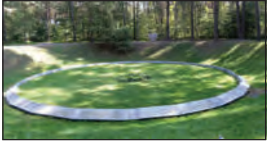
Ponar forest: One of the pits where the bodies were buried.

Whereas I, numbed by the horrors of Ponar, shied away from examining anything too closely,