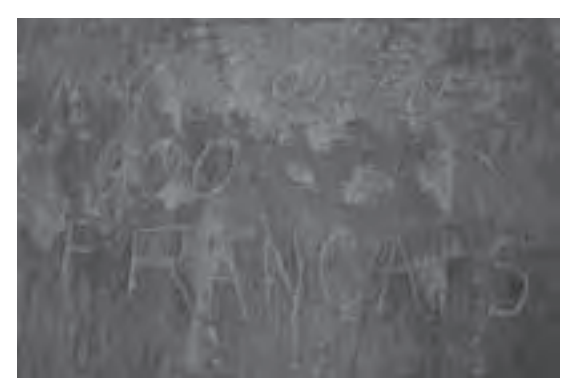
Engraving by Jewish prisoners in the Ninth Fort in Kaunas: "We are 900 Frenchmen".

In May 1944 a train, the Convoy 73 carrying 878 French Jewish men from the camp in Drancy in the Paris suburbs, arrived at the 9th Fort. Two thirds of their number were imprisoned in the fort; none survived. The remaining third were taken to Tallinn in Estonia, and finally to the Stutthoff concentration camp in Poland, of whom 22 survived. The prison in the 9<sup>th</sup> Fort is now a museum<sup>24</sup>. One of the cells where these Frenchmen were held contains a commemoration of the convoy. There is a plaque listing every one of them, and photographs provided by surviving family members show their erstwhile lives in France. Most poignant, however, is a last physical trace of their passing, a section of wall where several among them scratched their names in the plaster, and the inscription Nous sommes 900 Français - "We are 900 Frenchmen". The mystery which always surrounded the Convoy 73 was why it was headed for the Baltic countries and not Auschwitz-Birkenau as was generally the case. The men embarking on that train were led to believe that they were "volunteers" who would be doing construction work for the Todt Organisation, a way of avoiding a worse fate.