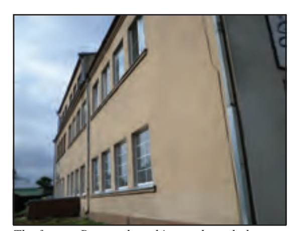
The former Ponevezh yeshiva, today a bakery

We spent our first night outside of Vilnius in Panevezys, the fifth largest city in Lithuania, with a population of 99 690 in 2011.<sup>3</sup> We stayed at the Romantic Hotel, probably our most upmarket accommodation with a wonderful view over the city. In the morning we managed to locate the building that housed the famous Ponevezh yeshiva of Rabbi Kahaneman. Now a bakery, it has a plaque in Yiddish and Lithuanian to identify it. As in Ukmerge, the large Jewish cemetery has been replaced by a beautiful park. In it is a memorial statue of a woman covering her face and crying up to heaven, with a menorah and an inscription in Hebrew from the first chapter of the Book of Lamentations: "For those I weep..."