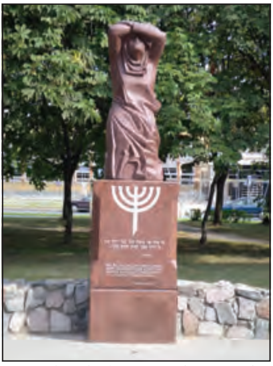
Memorial at the former Jewish graveyard in Ponevezh, today a city park