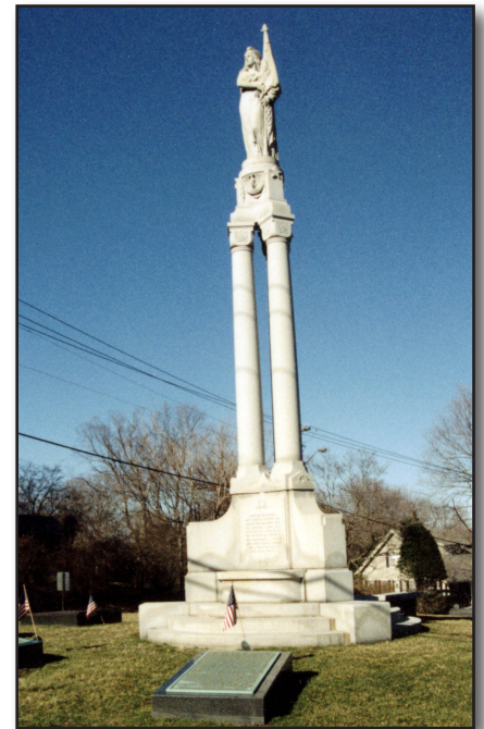
This memorial in the town square includes the name of Israel Goldstein.