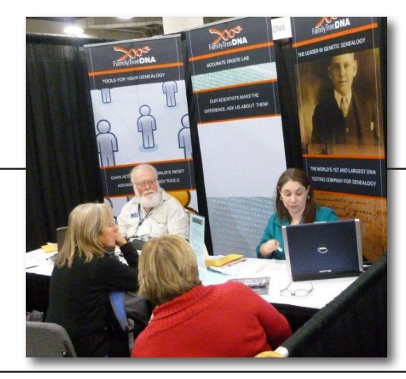
RootsTech 2013 Conference is scheduled for March 21-23, in Salt Lake City, Utah. For more information <u>click here</u>.

In addition to Ancestry and MyHeritage, other providers to the DC2011 Resource Room, included the New England Historic Genealogy Society (NEHGS), FindMyPast (recently purchased by brightsolid, which we're apparently going to hear more from in the coming year), and Fold3 (formerly Footnote. com).