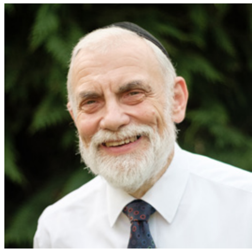
JUNE 2016: THE SALASNIKS