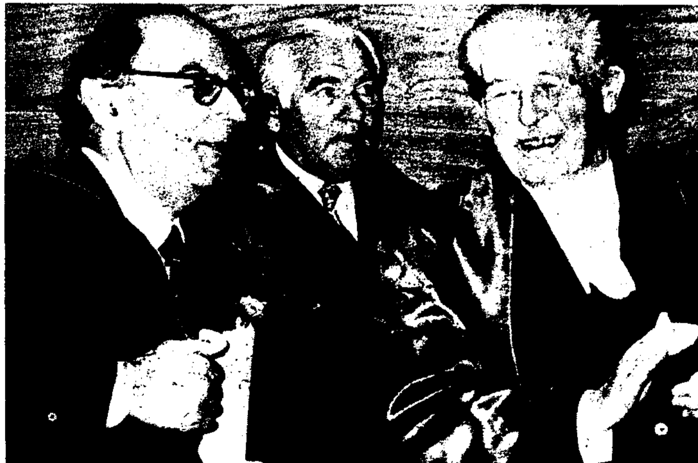
Sir Isaac Wolfson (centre) pictured at the opening of Wolfson College, Oxford, with Professor Sir Isaiah Berlin (left), then president of the college, and Mr Harold Macmillan, chancellor of the university

Despite its lack of conventional and identifiable communal facilities, many Jews for many years have discovered in Oxford a welcoming and stimulating environment. And to be in "that sweet city" on a Sabbath eve is to find it easy to feel about Oxford as Matthew Arnold did 100 years ago that "Lovely all times she lies, lovely tonight!"