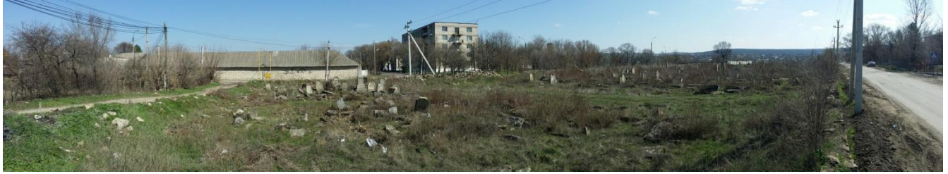
Panorama of the cemetery