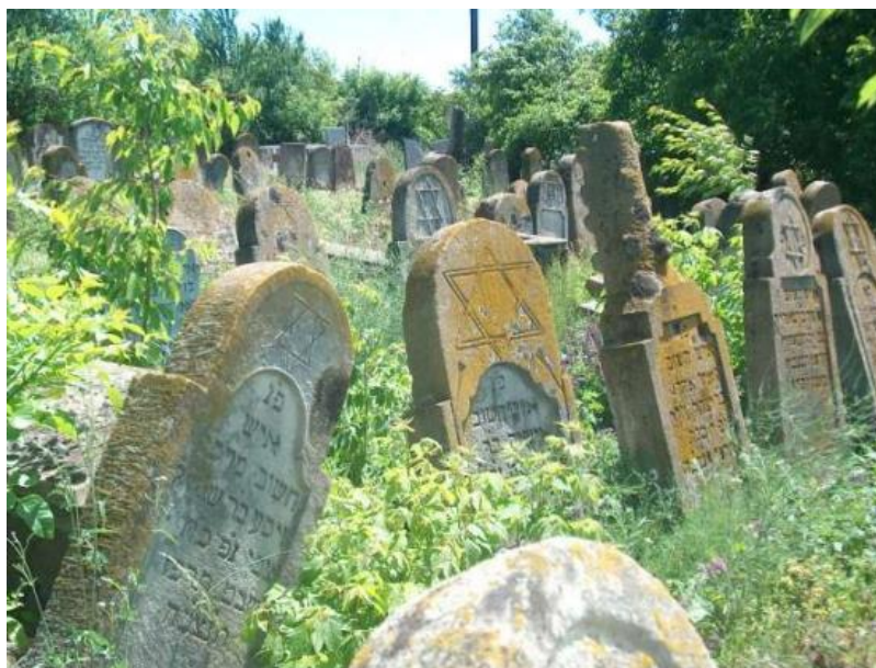
Photo from the Jewish Heritage Sites and Monuments in Moldova report.