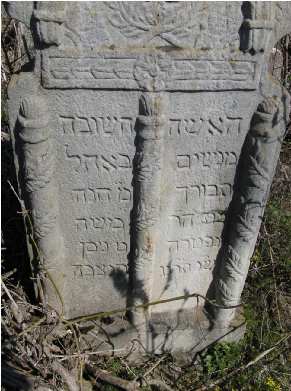
One of the oldest tombstone