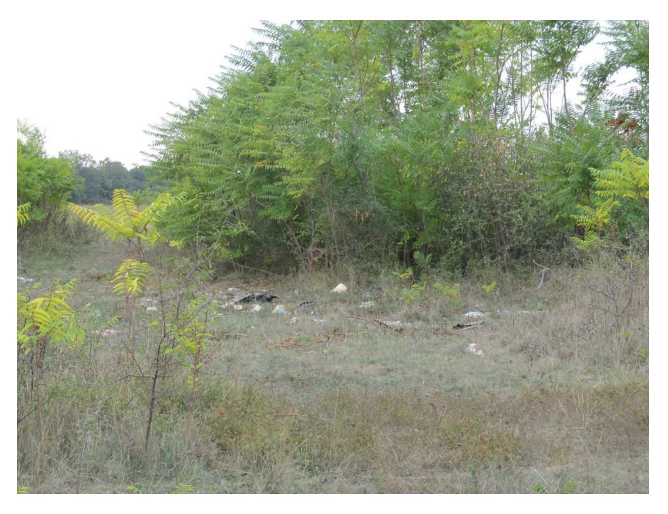
Dump close to the remaining stones