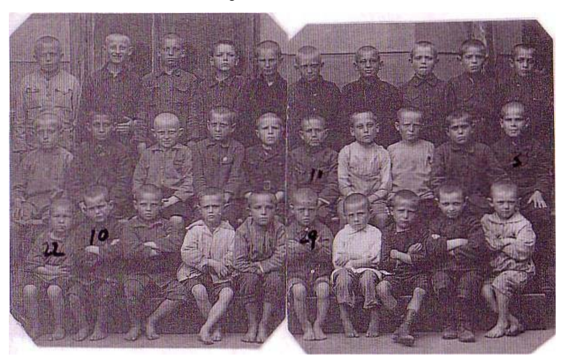
Passport photo of the Ochberg Orphans

I am continuing to collect their memories through the eyes of their children and when I have collected enough of their memories will put them in a separate book which will be a fitting memorial. I invite the children of Ochberg Orphans to contact me at sedsand@ca.com.au with their parent's stories.