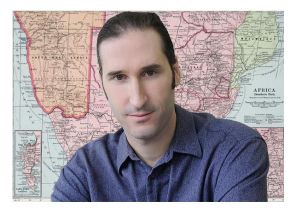
This article was originally published in Tablet Magazine on October 17, 2013, and is republished here with permission.

Reading about the Jews of South Africa is like seeing the history of American Jewry in a funhouse mirror: The outlines are similar, but the individual features are either heightened or shrunken. In terms of population, South African Jewry is nowhere close to American Jewry: Currently there are about 75,000 Jews in South Africa, as opposed to 5 million here. But both populations were formed at about the same time, during the exodus of Jews from Eastern Europe between 1880 and 1920 (the vast majority of South African Jews came from Lithuania). Both communities clustered around a major city-New York City here, Johannesburg there. Both waves of immigration were cut short by xenophobic, partly anti-Semitic legislation between the wars. Both communities were pro-Israel and politically liberal, with Jews supplying leaders of both the American Civil Rights movement and the South African anti-apartheid movement. Yet ironically, both American and South African Jews benefited, in terms of assimilation, from the existence of an even more stigmatized caste of black citizens, which allowed Jews to be considered generically "white."