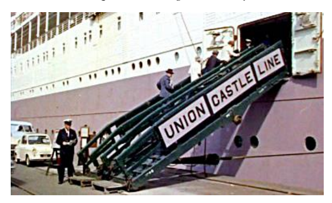
Emigration from South Africa to London in the 1950's and 1960's.

A shorter version of this article was published in the London Jewish Chronicle on 9 June 2013 under the title "Britain's quietest immigration story."