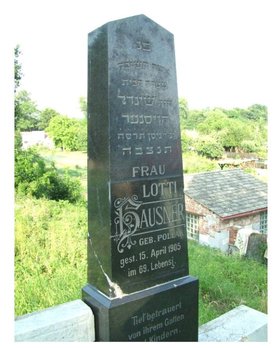
Lotti Hausner (née Pollak) Died 15 April 1905 at age 69