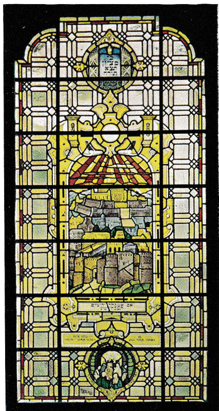
LL7. Jerusalem in Glory