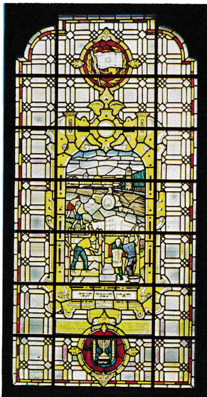
LL12. Israel Reborn