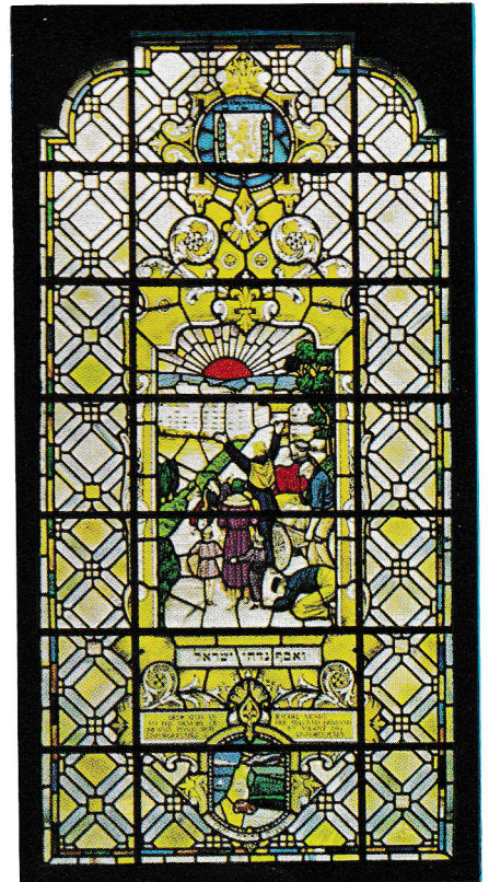
LL10. The Exiles’ Return