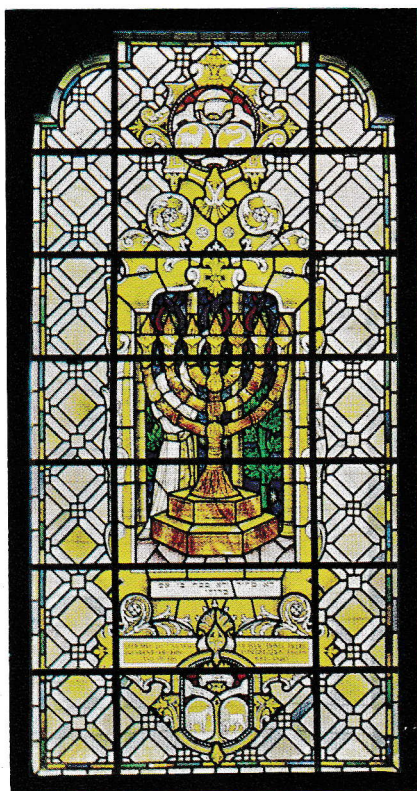
LL8. Temple Menorah