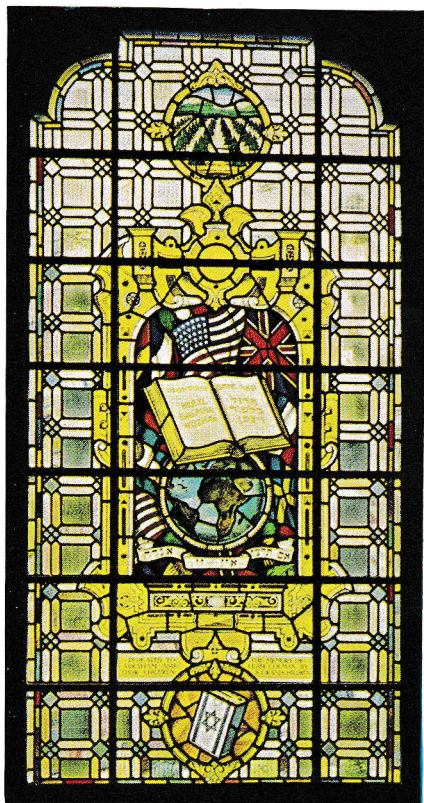
LL11. World aid to Israel