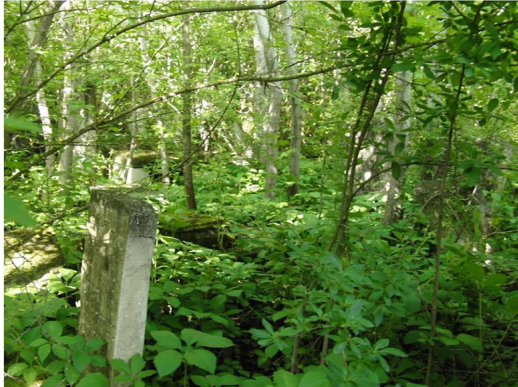
Here is a corner of a cemetery in Brichany