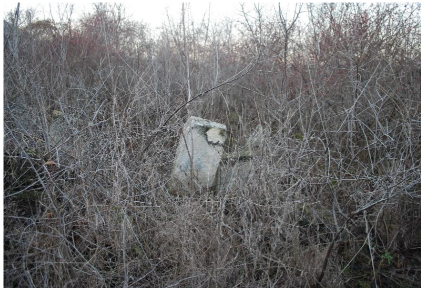
Monument at Hincheshty Jewish cemetery