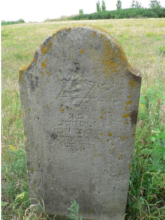
The only remaining tombstone in Dumbroveny Jewish cemetery