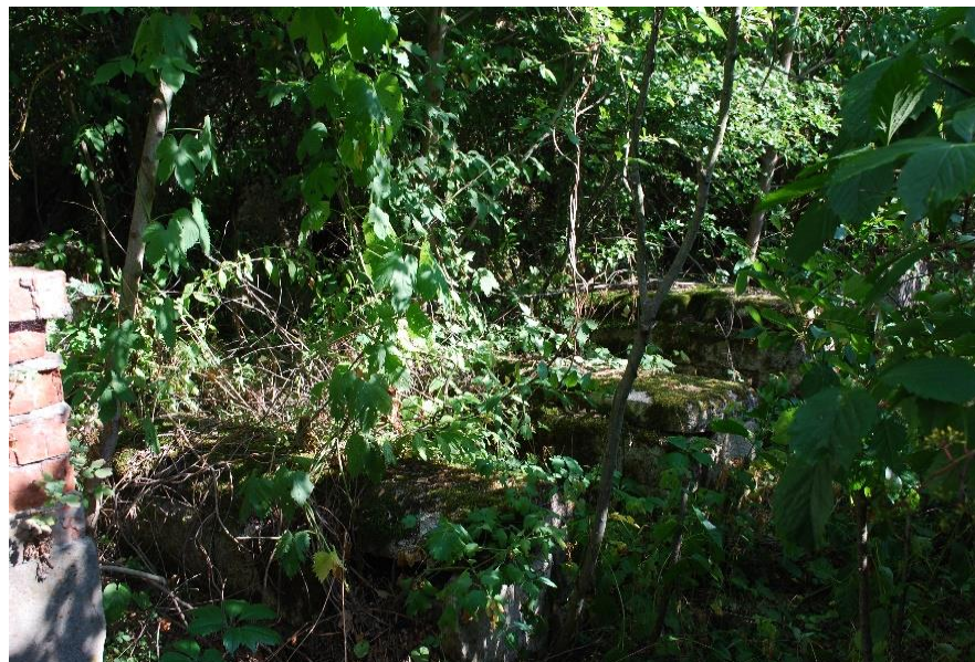
At Rashkov cemetery