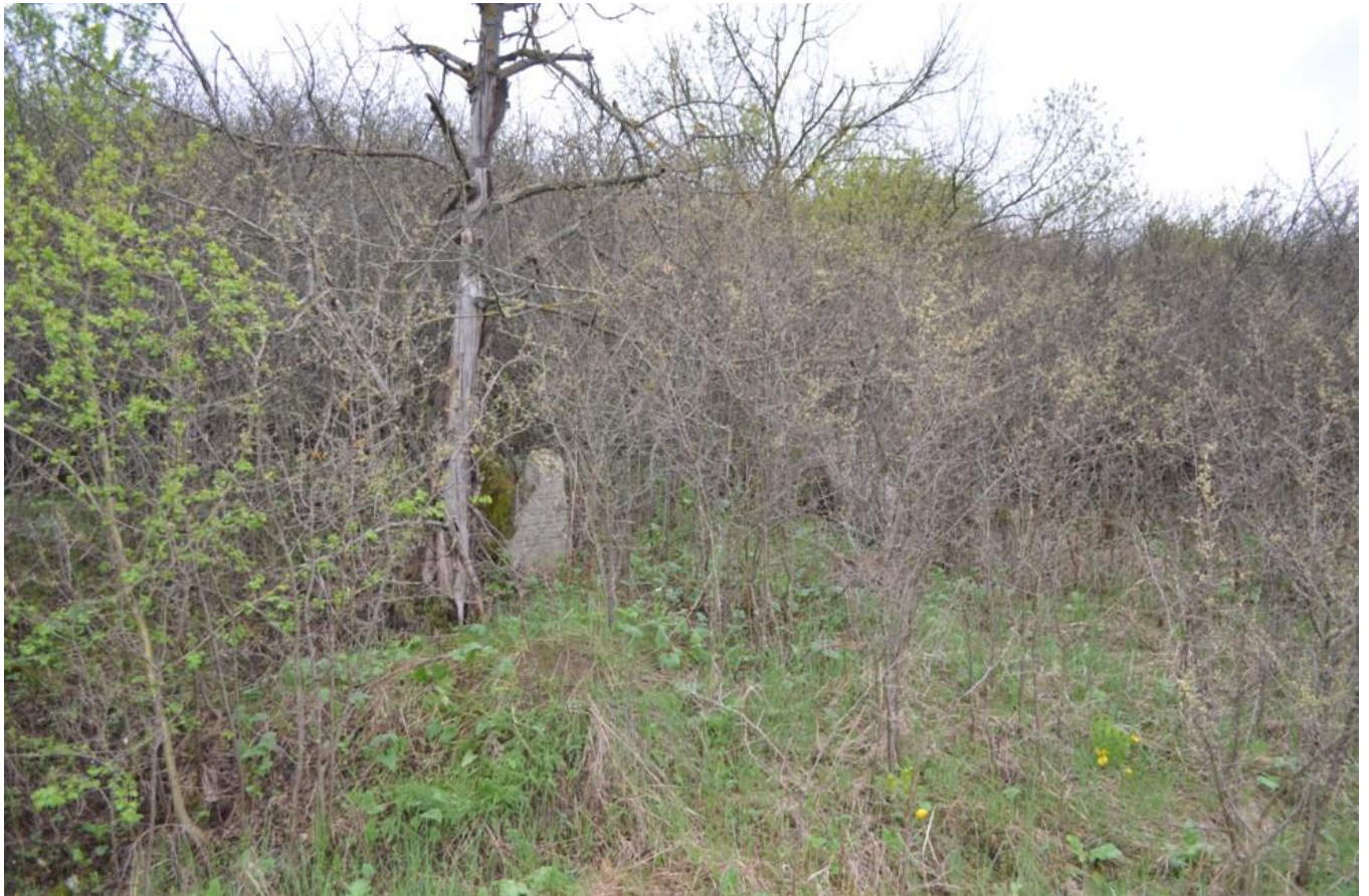
On of the monuments in the woods

If you know a person who was buried in that cemetery or have some old or new photos from the cemetery, please share information with the group and records, photos will be added to this report.