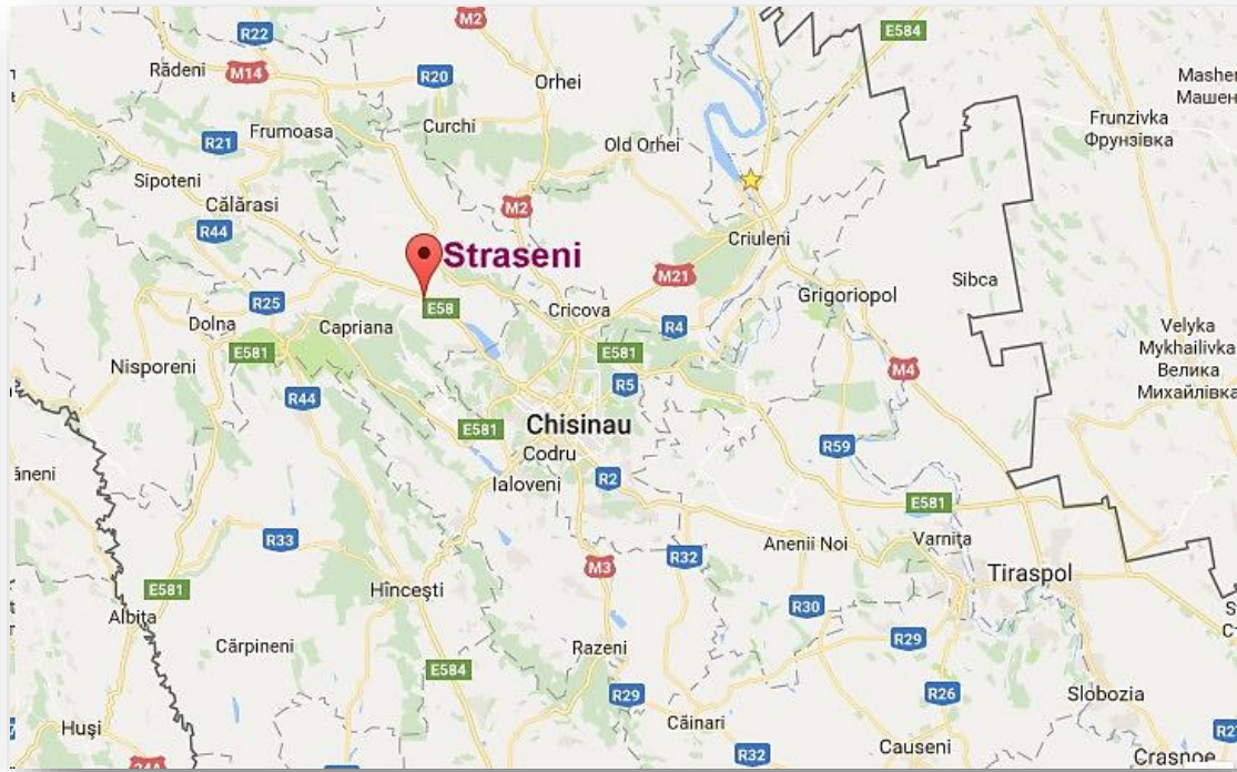
Straseni on the Google Map. Close towns to the South East are Kishinev, and North West Calarasi, and to the West Nisporeni.