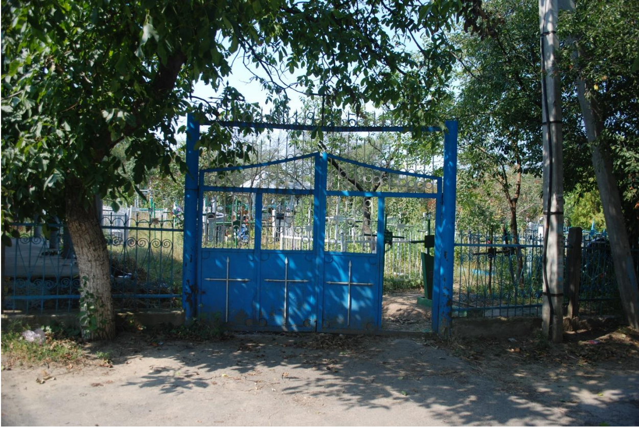
The Gates to the Town Cemetery, where there is a section with Jewish graves.