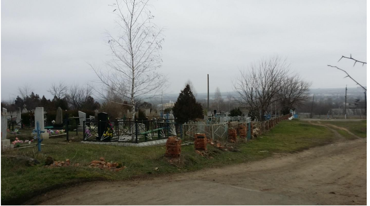
View on the town cemetery in Sarata, Odessa Oblast, Ukraine