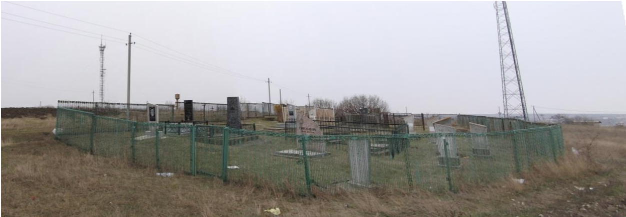
The whole fenced Comrat Jewish cemetery