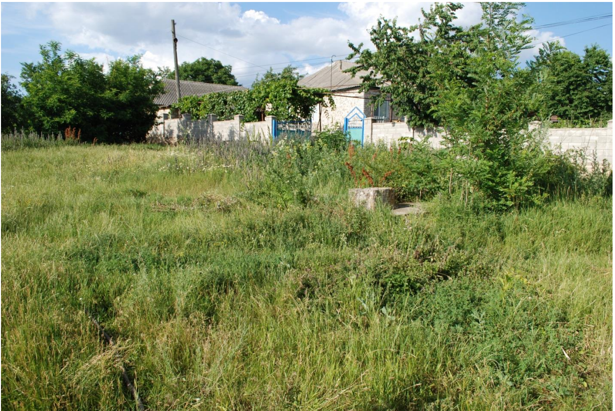
One of the stones near the tree