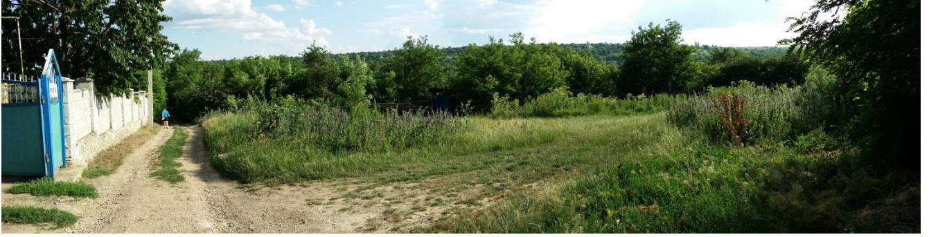
Field where the tombstones found