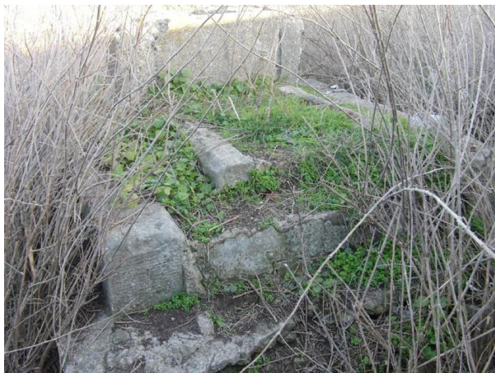
Grave of a Rabbi (no inscription), 2013, Serghey Daniliuk