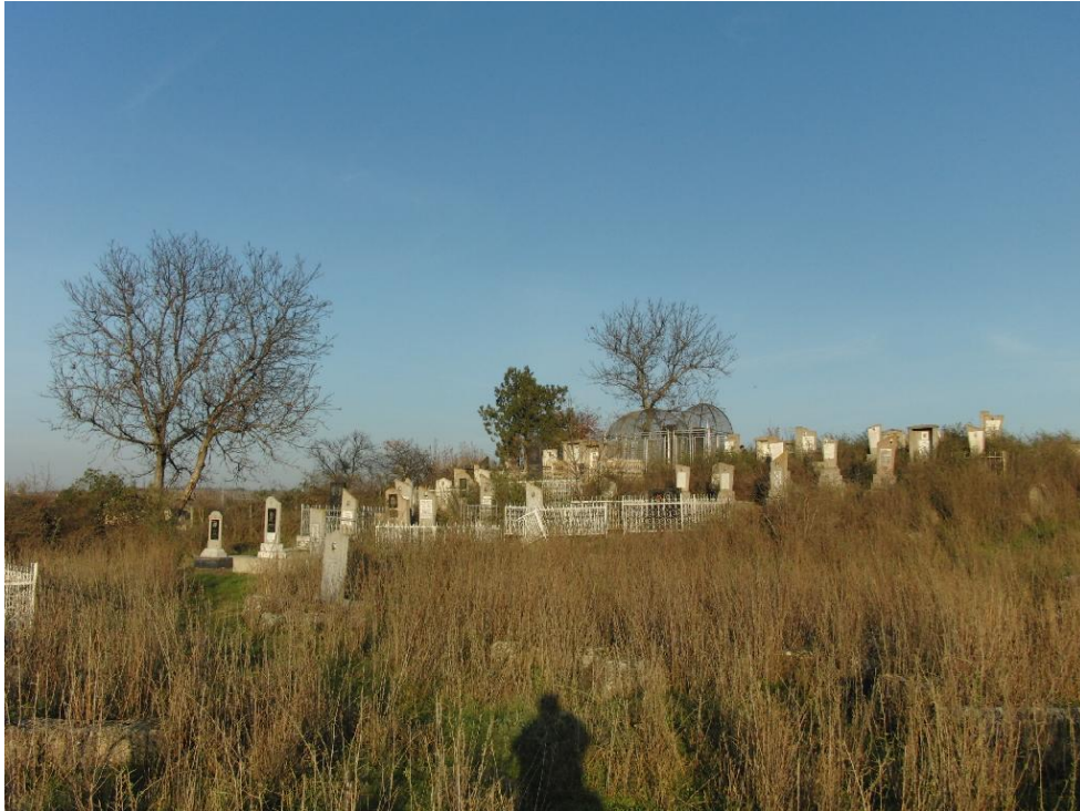
The overview of the cemetery