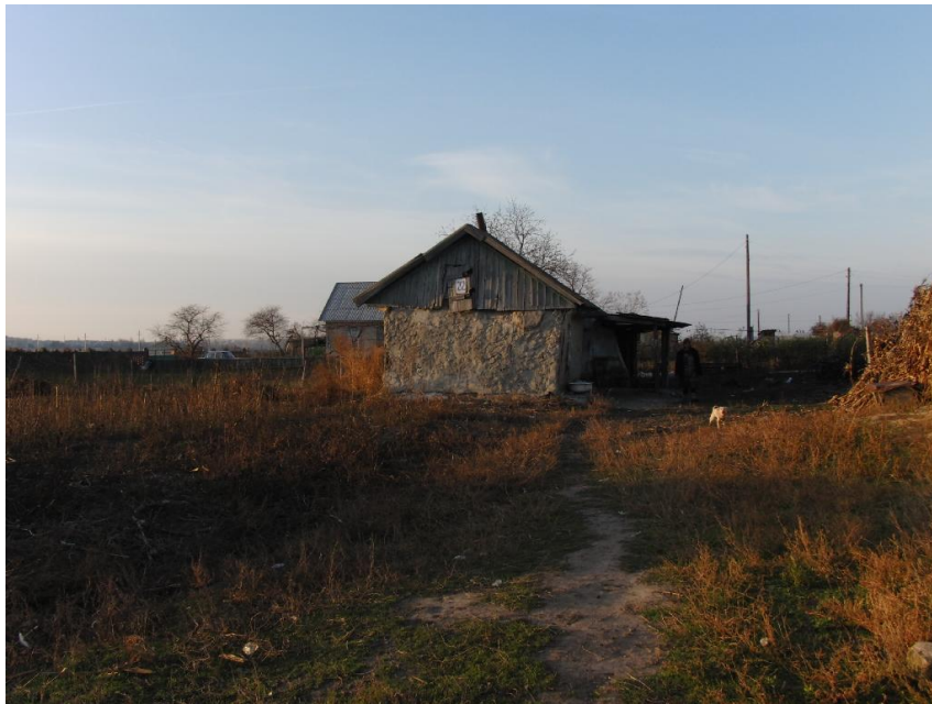
House, where Cemetery caretaker used to live.