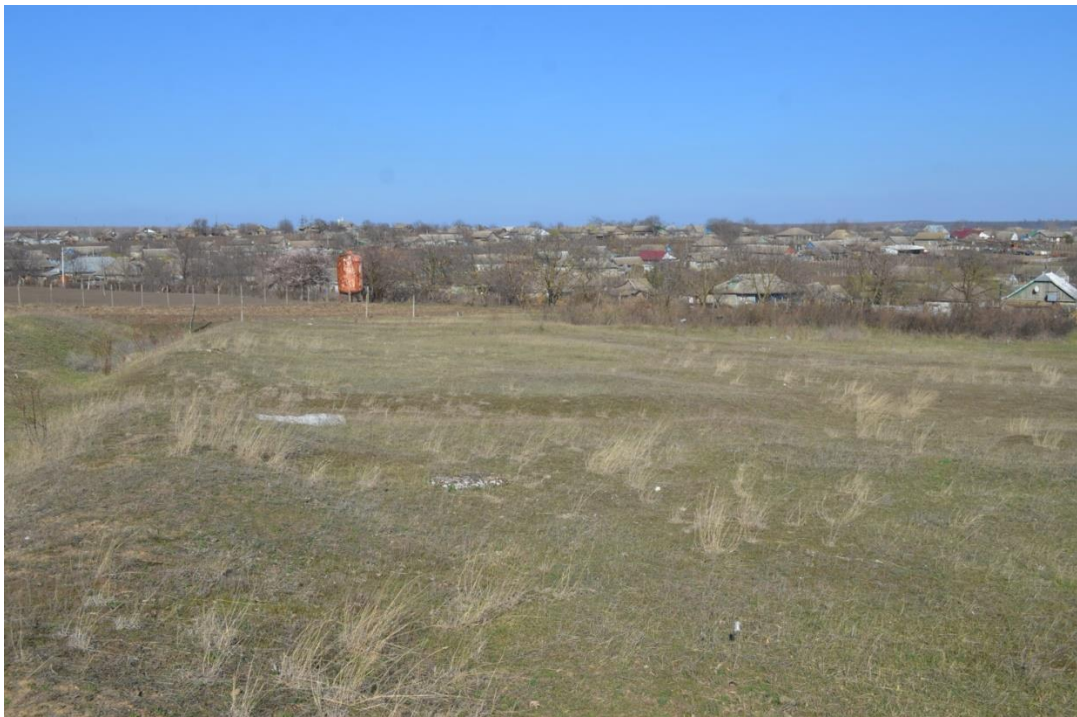
Field which used to be the Jewish Cemetery