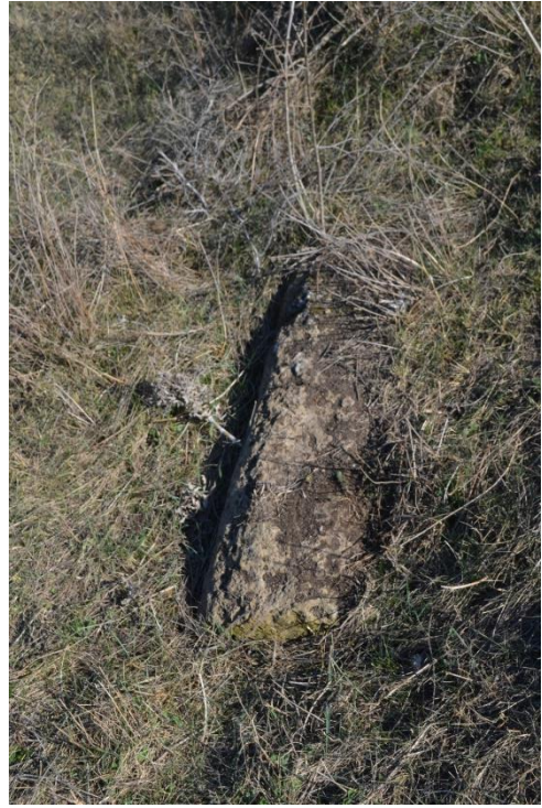
Two more unknown graves