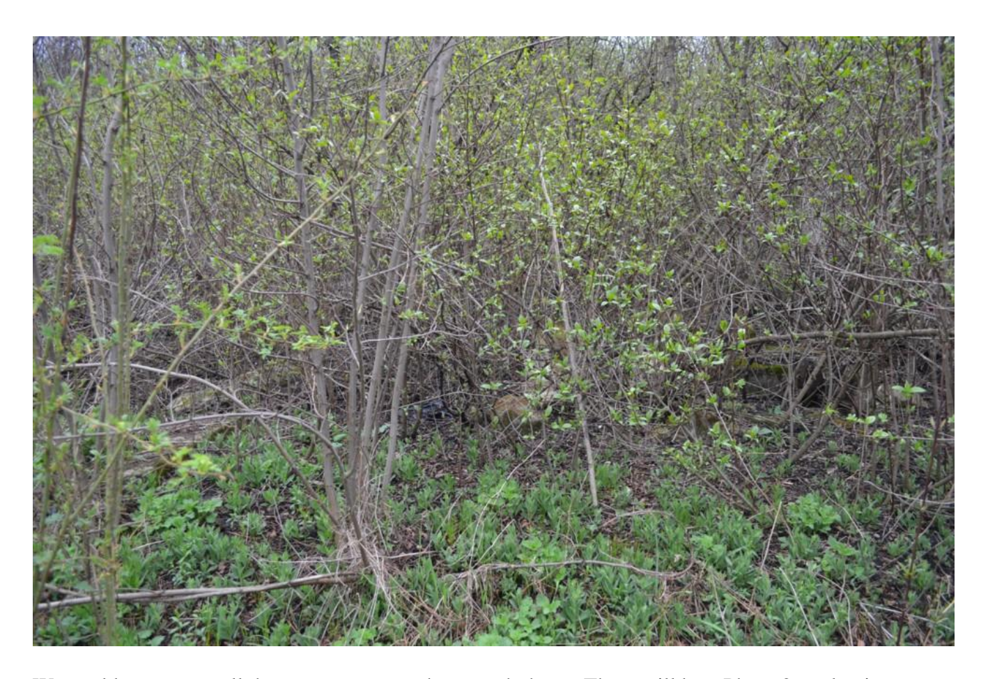
We could not access all the gravestones to photograph them. There will be a Phase 2 to clearing paths to every grave on that cemetery.