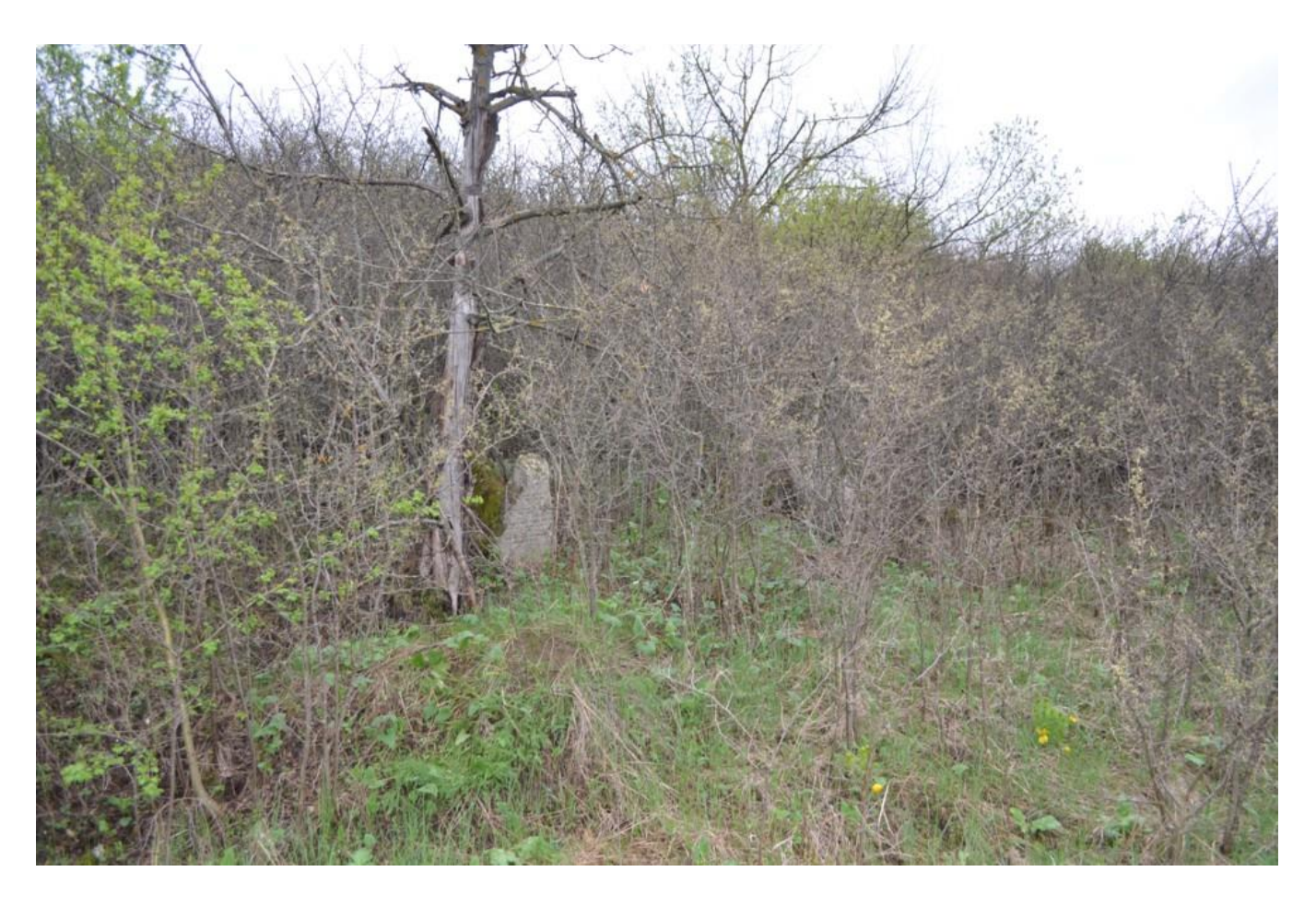
On of the monuments in the woods

If you know a person who was buried in that cemetery or have some old or new photos from the cemetery, please share information with the group and records, photos will be added to this report.