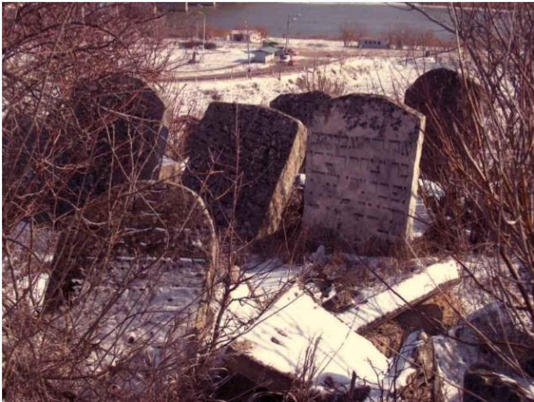
Photo from the Old Jewish Cemetery of Rezina.

It is almost impossible to locate the cemetery’s borders today, as there are no walls or fence and nearby housing developments have encroached upon the cemetery. New building continues to be a problem. There are approximately 500 gravestones still visible, but more may be toppled and out of view. The site does not have a regular caretaker and it has been neglected in recent years. The vegetation overgrowth is a constant problem which threatens the condition of the gravestones. The cemetery has also been a target of vandalism.