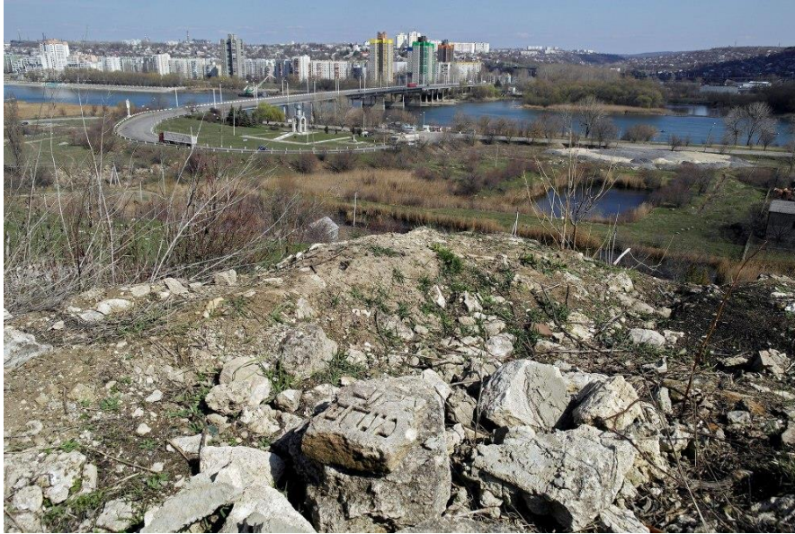
A view from the Old Rezina cemetery on the Dniester River and town of Rybnitsa on the other side.