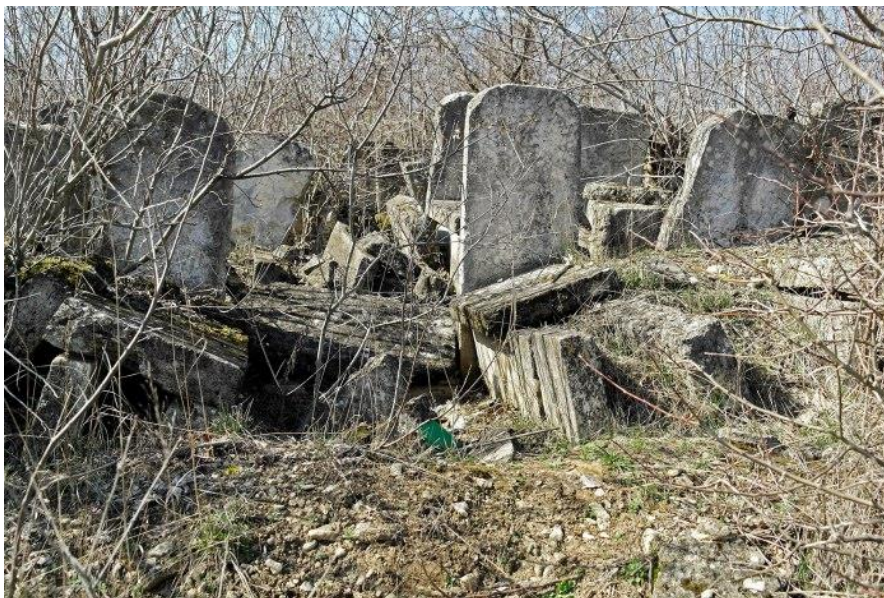
Gravestones covered by trees and bushes.

Please read Herrmann’s blog “Back on the banks of River Dniester”: