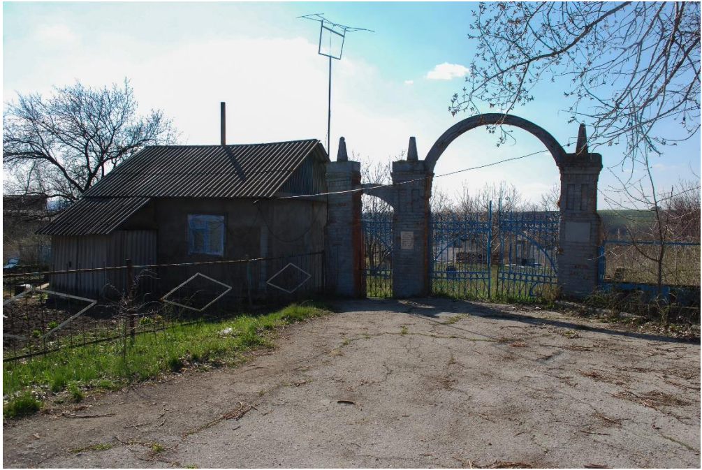
The Gates to the cemetery.