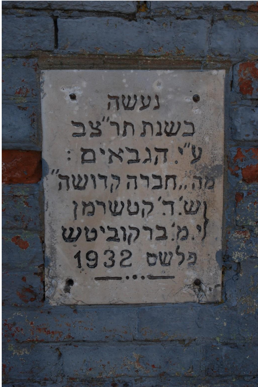
Tablet at the entrance to the cemetery

Created in 5692 by treasurers of the Chevra Kadisha (burial society):