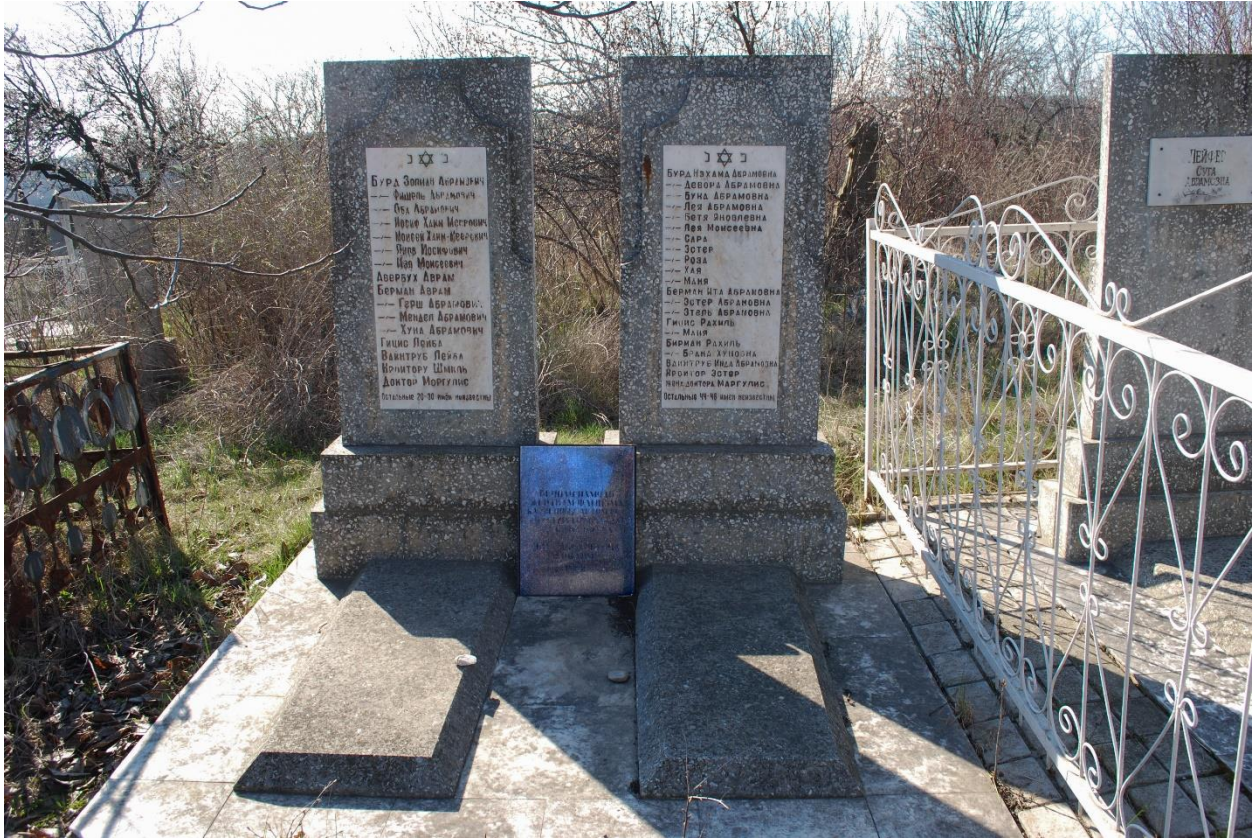
There are two memorials with 36 Jews killed in the Holocaust. All names were entered to the registry with death 1941-1945.