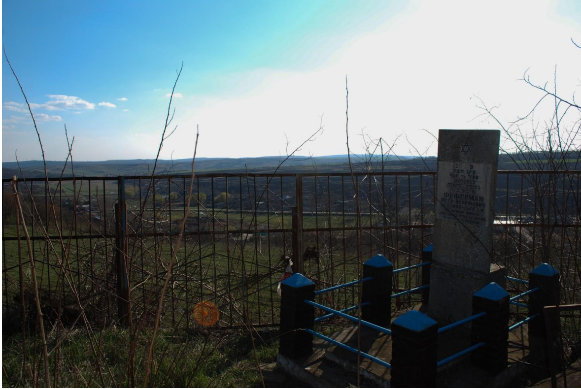
Corners of the cemetery