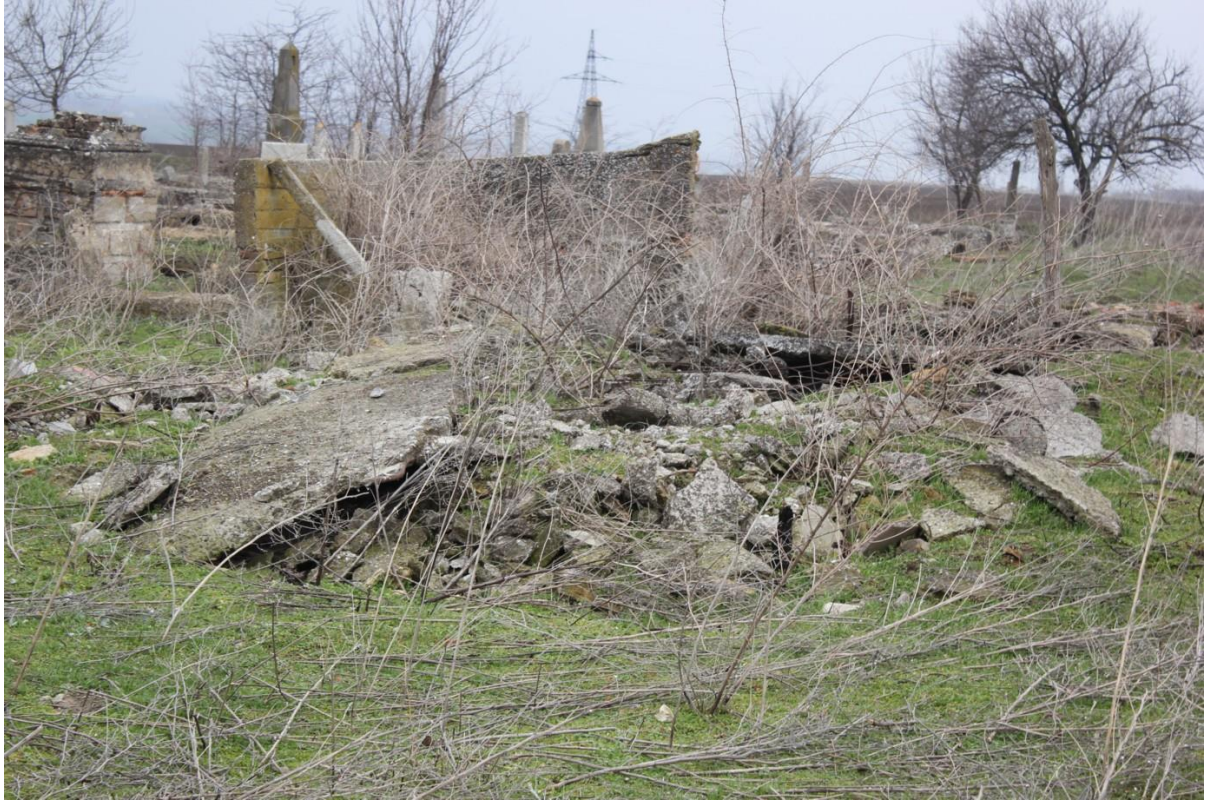
Corners at the cemetery