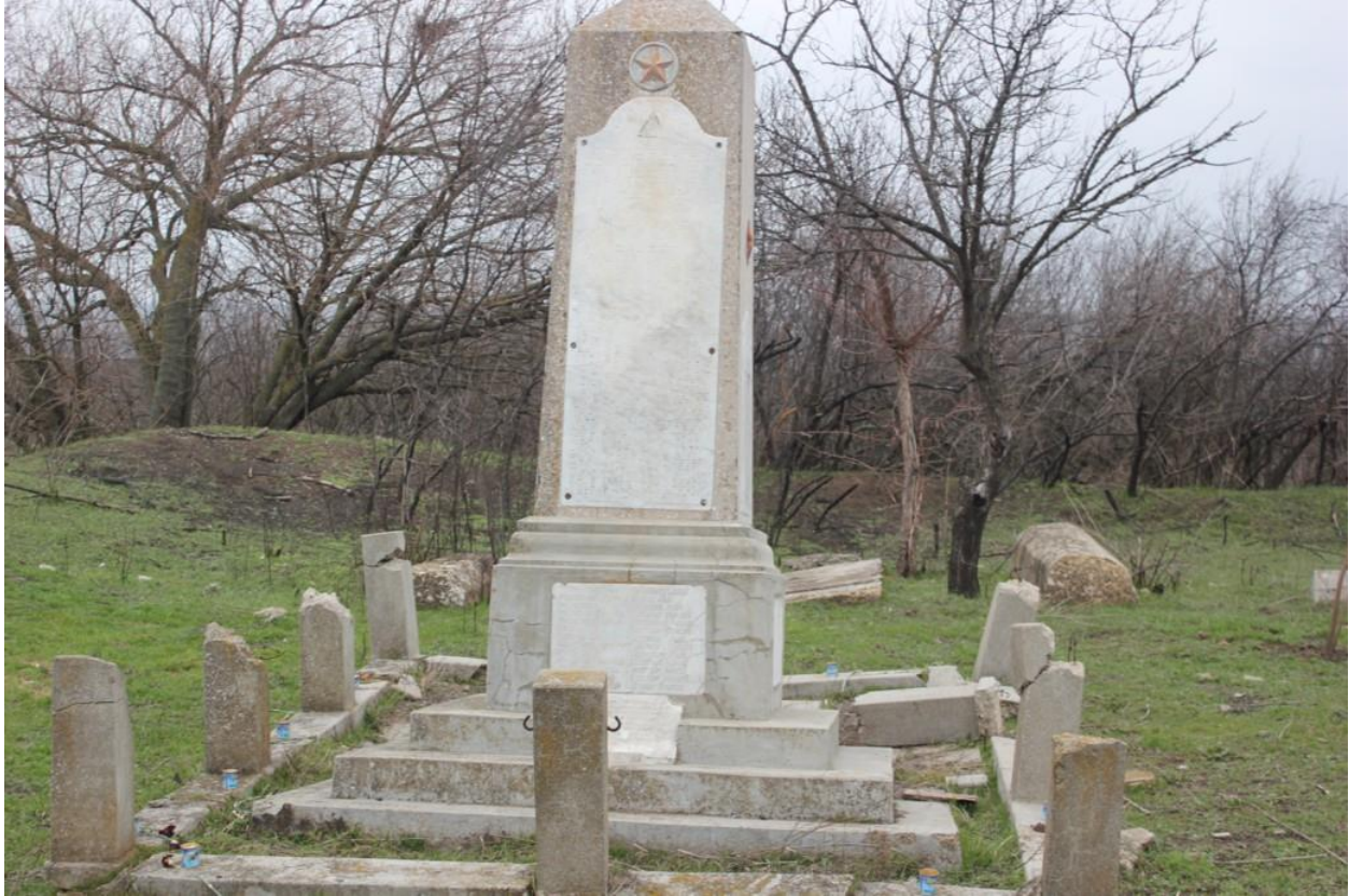
Monument of Holocaust Victims