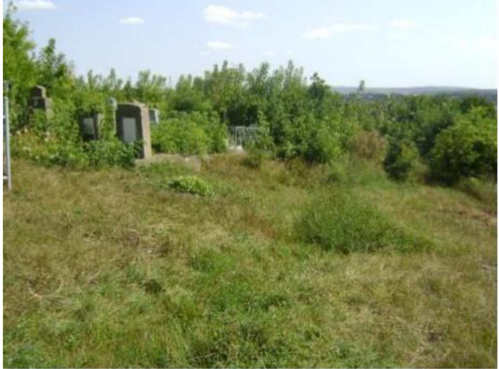
View at the cemetery