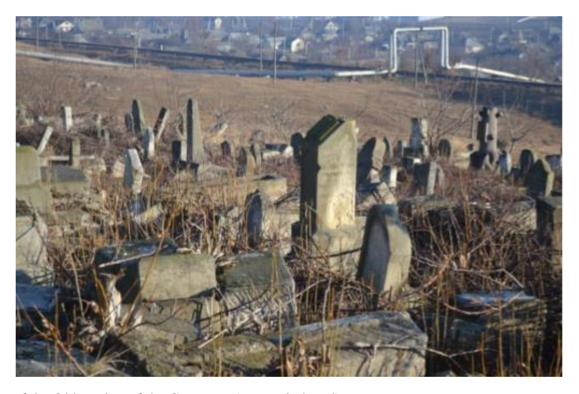
Part of the Old section of the Cemetery (not yet indexed).