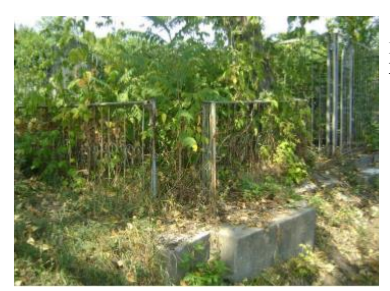
Different corners of the corners of the Beltsy Jewish Cemetery