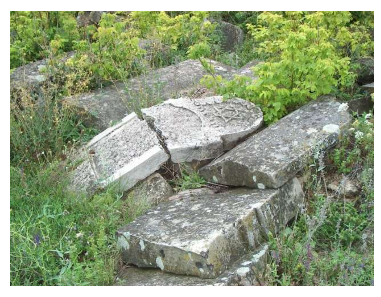
The 5,000 square meter area of the Jewish cemetery in Markuleshti is surrounded by a broken masonry wall. The cemetery contains more than 1,500 stones which date from the 18<sup>th</sup> century. The site has been neglected, however, and more than 75% of the stones are broken or toppled. The cemetery is rarely visited and there is no regular caretaker. The area is overgrown and the site has had some vandalism in recent years.