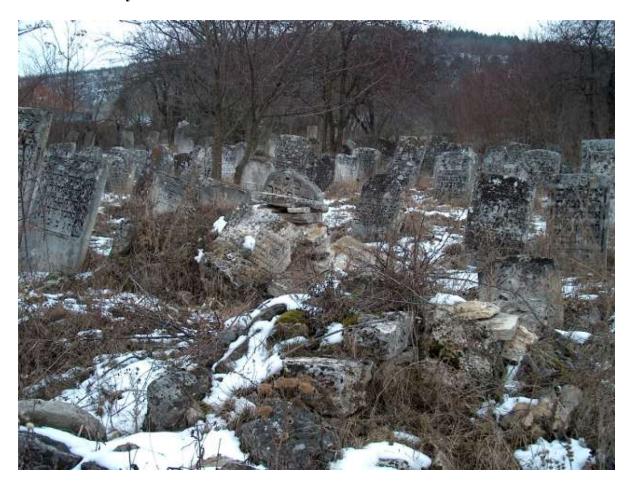
The 20,000 square meter cemetery is surrounded by a ruined stone wall. The cemetery contains more than 5,000 extant gravestones that date from the 18<sup>th</sup> to the 20<sup>th</sup> centuries. The site is now deserted and overgrown and more than half of the stones are toppled or broken.