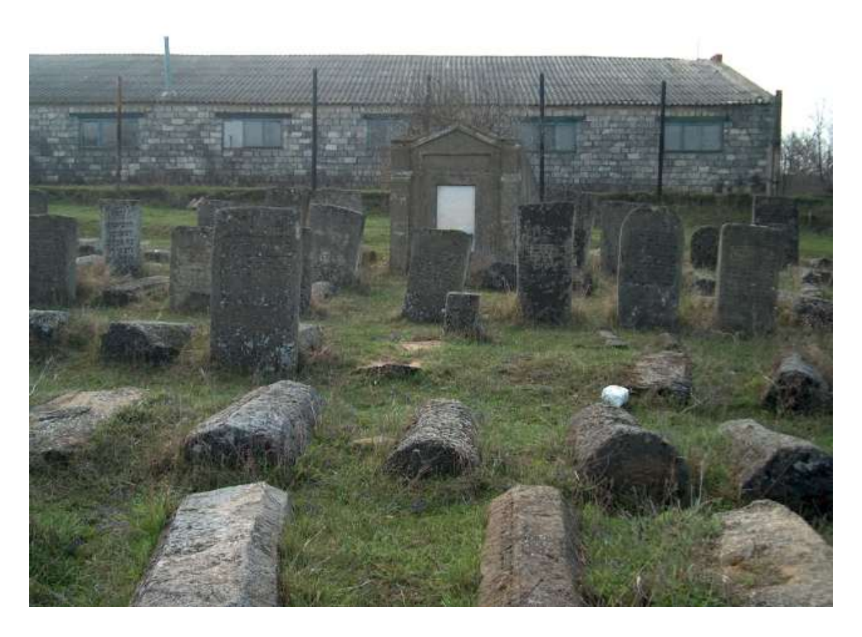
The 1,500 square meter area of the Jewish cemetery in Leova is surrounded by a fence with a gate. There are more than 1,000 extant gravestones; the oldest from the 17<sup>th</sup> century. More than half of the stones are broken or toppled and vegetation overgrowth prevents easy access. There is no caretaker and the cemetery is rarely visited.