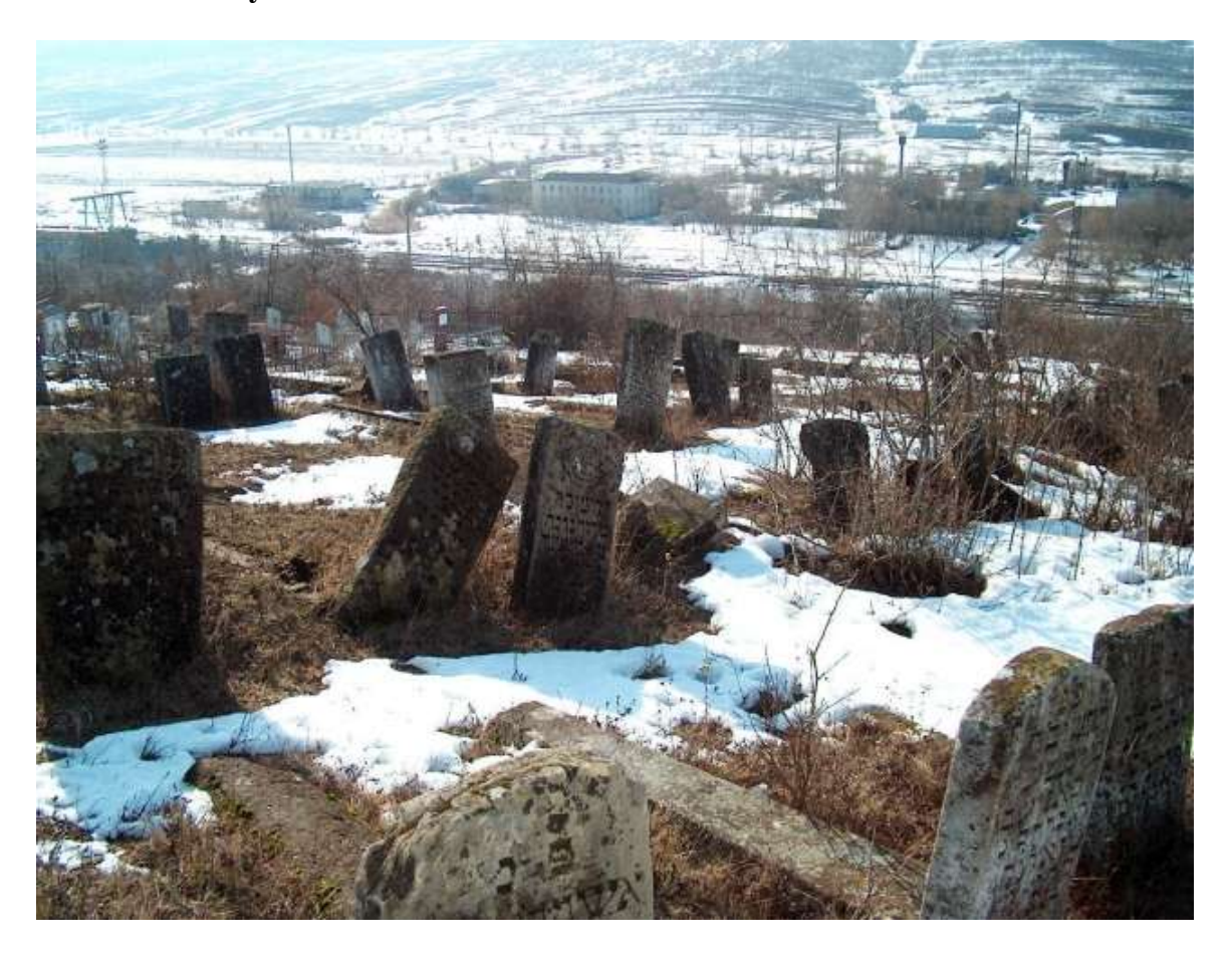
Jewish Cemetery / Holocaust Monument

The Jewish cemetery is about 60,000 square meters, and is surrounded by a broken fence. It contains over 500 gravestones, almost half of which are toppled or broken. The oldest stones date from the 19<sup>th</sup> century. There is a monument to the Holocaust victims, which was recently restored with private funds. The cemetery is still in use, but receives little maintenance. It is occasionally cleared by local residents, but overgrowth is a constant problem. The site is also in a landslide zone, where there is constant erosion and the threat of earth slides.