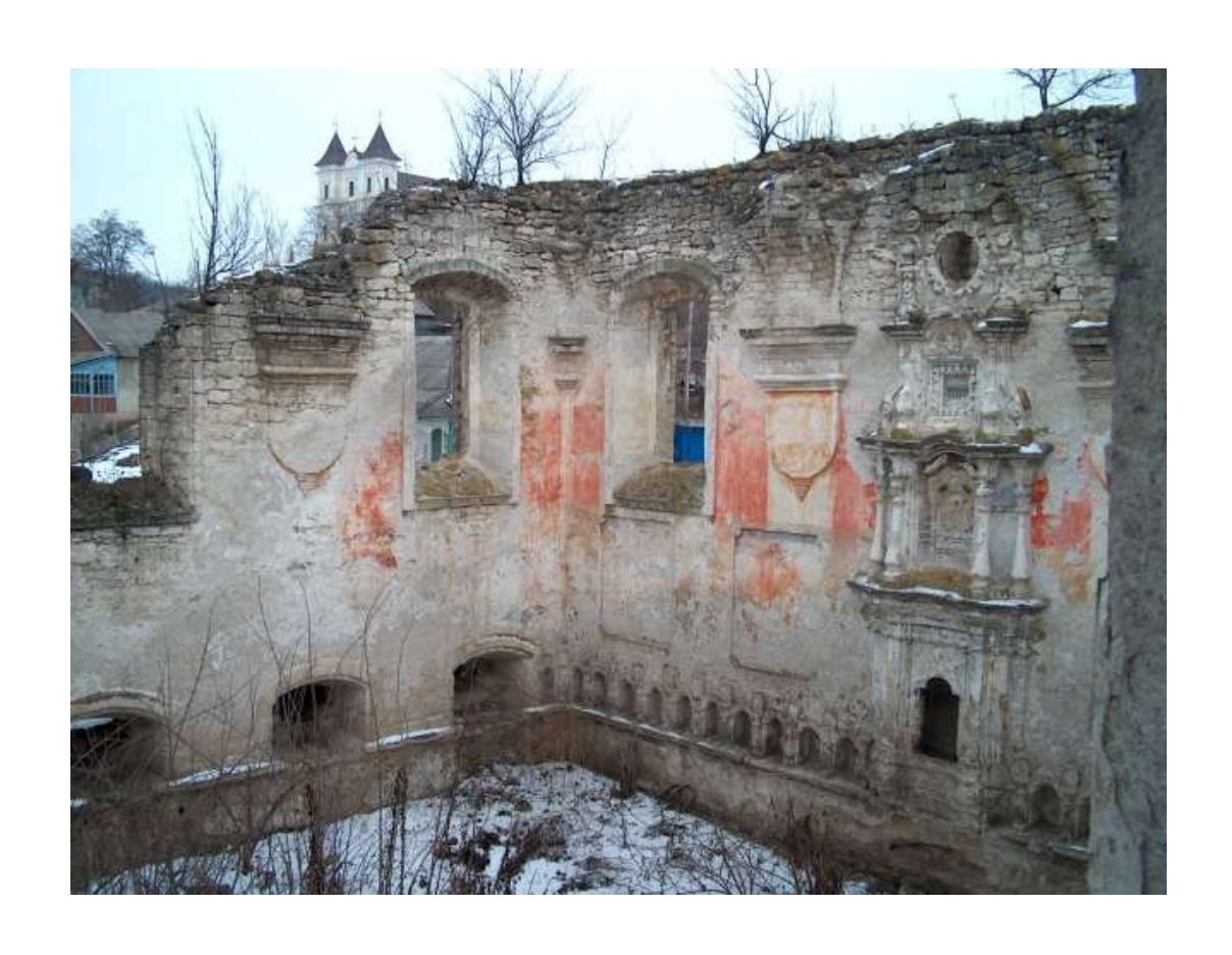
United States Commission for the Preservation of America's Heritage Abroad