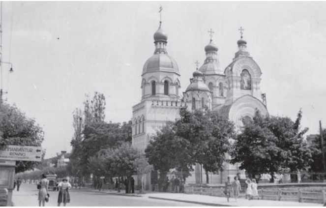
FIGURE 2.12 Pokrovskii Cathedral in Rovno: the Orthodox cathedral at Grabnik Square where the Jews were assembled on November 7, 1941. 17,500 Rovno Jewish adults and more than 6,000 of their children were forced to leave their bags in large piles on the square, then to walk to the killing site at Sosenki Forest, some four kilometers east of the city center.