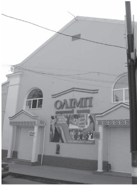
FIGURE 3.3 Rovno’s Great Synagogue is now the site of a fashionable fitness and shopping center.