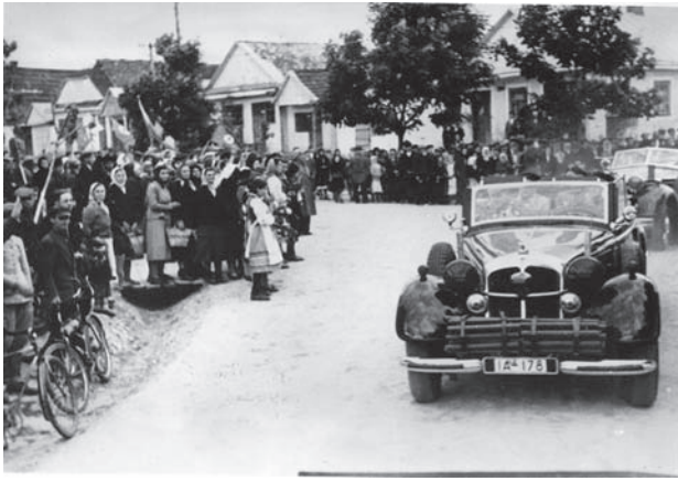
FIGURE 3.2 Reichsminister Alfred Rosenberg enters Rovno on June 22, 1942 to celebrate the one-year anniversary of the war with the Soviets.