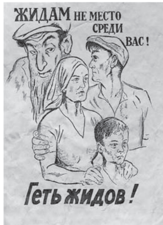
FIGURE 2.6 “There is no place for yids among you! Out with the yids!”