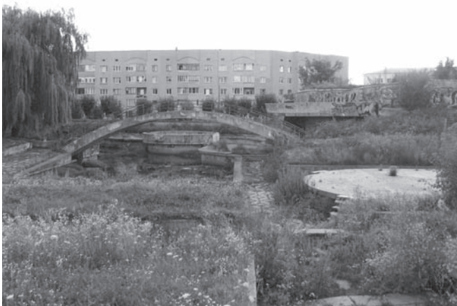
FIGURE 3.4 Grabnik Square, adjacent to Pokrovskii Cathedral, is now a decrepit and rundown urban blight.