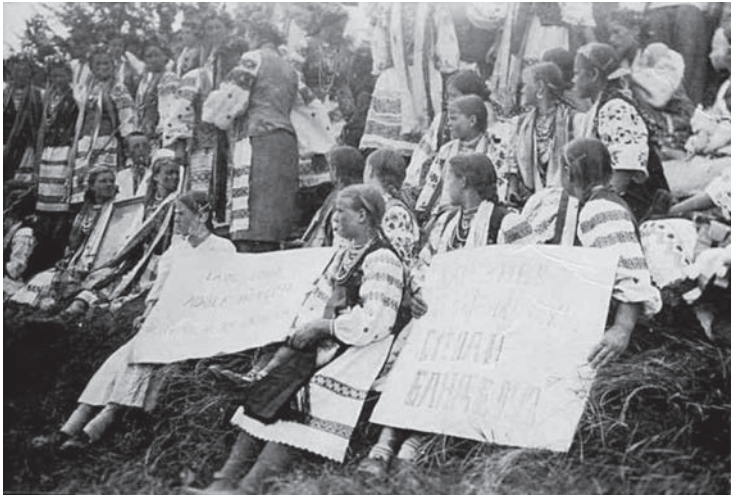
FIGURE 2.11 (Left) “Long Live Adolph Hitler!” (Right) “Long Live Stepan Bandera!”