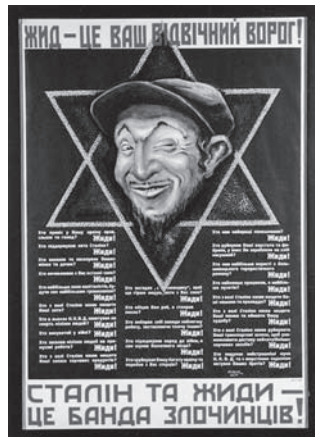
FIGURE 2.7 “The yid is your eternal enemy!... • Who brought you famine, tears and mass murder? THE YID! / • Who devised the worst NKVD torture methods and sadistically tortured your brothers? THE YID! / • Who worked least and ate best? THE YID! / • Who abducts your wives and daughters and then defiles them? THE YID! / • Who has exterminated millions of people in the cellars of the NKVD? THE YID! / • Who has the nicest apartments? THE YID! / • Who denounced capitalists the most but had an insatiable lust for money himself? THE YID! / STALIN AND THE YIDS -ONE VILLAINOUS GANG!”