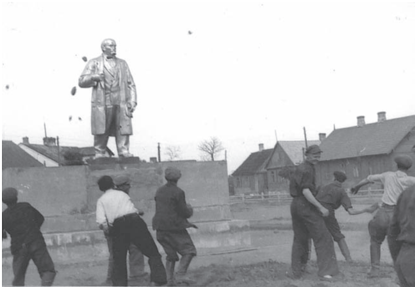
FIGURE 1.4 Local Poles throw stones at a Lenin statue in Białystok, Poland, July 1941

Second, the Holocaust in the East was by and large carried out openly, in the presence of non-Jewish locals. In the West, most Jewish victims of the Holocaust were rounded up and forcibly transported in sealed trains to concentration camps in Central and Eastern Europe. This distance generated considerable space for deniability: that Jews had been the victims of deportation and forced labor, not of mass annihilation. In contrast, a much smaller proportion of Soviet and East European Jews were exterminated in camps. While most Western and Central European Jews perished in the “industrial efficiency” of the camps, most Jews in the Soviet and Eastern European zones were shot, and the overwhelming majority were massacred at designated killing sites in or near their own homes by predominantly local ethnic nationalist militias who played the central roles in their executions. 15