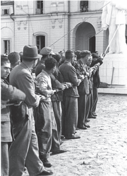
FIGURE 1.3 Iconoclastic destruction of a Stalin statue in Białystok, Poland, July 1941

In the first months of the war, Soviet Jews caught behind German lines were forced to take part in humiliating rites of iconoclastic violence—“Lenin funerals” and “Stalin parades”—where non-Jewish neighbors were encouraged to taunt Jewish men, women, and children as they dismantled symbols of communist authority, sang communist or Jewish songs, chanted communist or Jewish prayers. In dozens of documented cases, such rituals normally ended in violence—as the communist symbols, usually statues of Lenin or Stalin, were buried alongside local Jews who were massacred by their non-Jewish neighbors. 14 After the end of such “self-cleansing” pogroms in summer 1941, German propagandists and their local collaborators continued to report on actions against Jews in local media outlets, and regularly informed the local public about the progress in the war against the “Jewish-Communist” element.