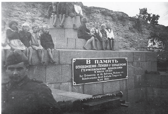
FIGURE 1.1 The Wehrmacht as an army of liberation from the Jewish-Communist threat. On the base of a destroyed Lenin statue in northwest Russia, the German occupying authority constructed a new monument with this plaque (in Russian and German): “In Commemoration of the Liberation of Pskov by the Germany Army, July 9, 1941”