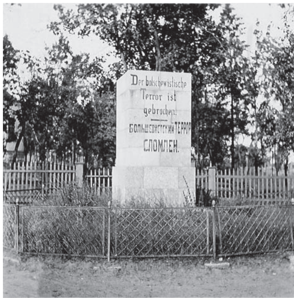
FIGURE 1.2 On the base of a destroyed Stalin statue in eastern Ukraine, written in German and Russian, “The Bolshevik Terror Has Been Broken.”