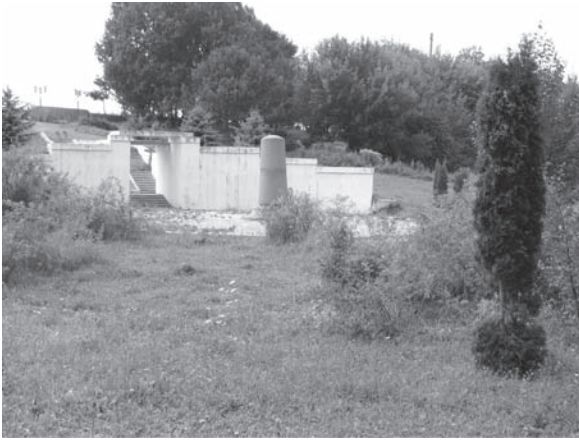
FIGURE 3.5 The Jewish Memorial at Sosenki constructed by Israeli and international Jewish donations in 1991 has now fallen into neglect and disrepair, overgrown with weeds, and the frequent target of anti-Semitic arson and grave robberies.