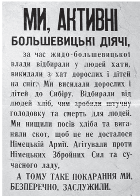
FIGURE 2.14 Black Propaganda: The False ‘Jewish-Bolshevik Confession’. To minimize local sympathies for Jews killed in mass Aktionen, the Germans often posted notices like this one “WE, ACTIVE Bolshevik Cadres, during the yid-bolshevik era seized the people’s homes, drove parents and children from their homes into the snow. We deported parents and children to Siberia. We seized so much of the people’s bread [that] we created an artificial famine, and people [starved] to death. We destroyed grain crops, drove livestock away so that the German Army would not get them. We continue to agitate against the German armed forces even now. AND THEREFORE WE, WITHOUT QUESTION, DESERVE SUCH PUNISHMENT.”

Source: YIVO Institute for Jewish Research, Nusya Roth Collection, RG1871.