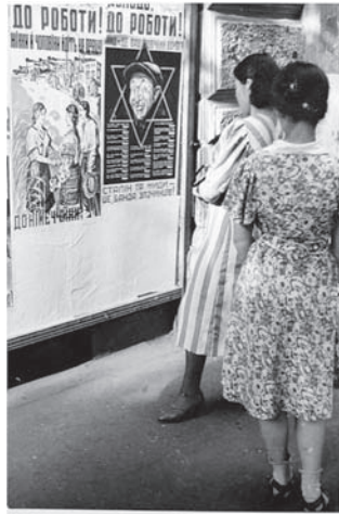
FIGURE 2.8 Ubiquitous culture of hate in German-occupied Ukraine. Ukrainian women view anti-Jewish hate posters, no date. In Ukrainian, the poster reads in part: “STALIN AND THE YIDS -ONE VILLAINOUS GANG!”