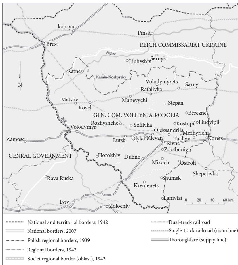
MAP 1 Western Volhynia