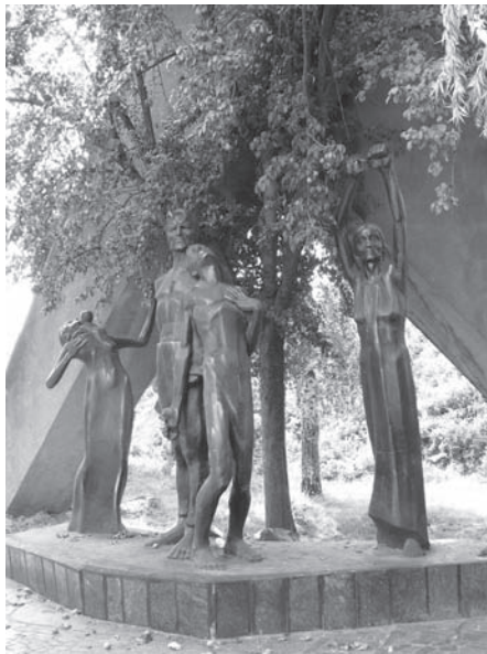
FIGURE 3.6 In contrast, the Ukrainian monument at the site of the Gestapo Prison and mass grave on Belaia Street is well maintained. The granite cross that marks the site remembers the “52,000 men and women” who died there, failing to mention that many were Jews.