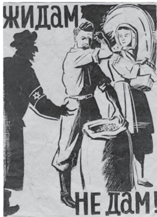
FIGURE 2.5 German Ukrainian-language anti-Jewish poster: “We will give nothing to yids!”

Immediately upon arrival, the German occupation authority made every effort to drive a wedge between local civilians and Jews. The standard orders posted in newly conquered zones read: “Should anyone give asylum to a Jew or let him stay overnight he, as well as the members of his household, will be shot by a firing squad immediately.” 25 Besides these notices, anti-Jewish placards were posted everywhere: “We will give nothing to yids!” “There is no place for yids among you! Out with the yids!” “The yid is your eternal enemy!”