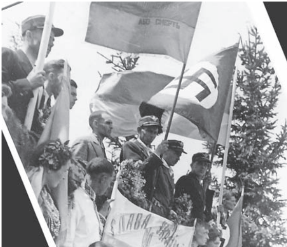
FIGURE 2.10 July 1941 celebration of German “liberation” in Rovno. Printed on the blue and yellow Ukrainian flag are the words: “Volia Ukraini abo smert”—“Freedom for Ukraine, or death.” On the banner is the symbol of the Ukrainian liberation movement, the trident (tryzub), and the nationalist oath: “Slava Ukraine,” “God Bless Ukraine!”

The German treatment of the Jews began to get worse and worse by the day. One day after working in the army barracks “Reichskommissar” Koch came upon an idea, that all men and women should undress completely and have each group pour water over the other group from large buckets, with water that was left over from washing the toilets, hallways and steps. Under the order of this armed maniac we were forced to perform this hellish act if we wanted to escape death. When an army unit was walking down the street and they came across a Jew on the road, they shot him on the spot because they believed Jews were bad omens. On another occasion, upon seeing a group of Jews standing in line, a motorcycle driver drove onto the side walk with his motorcycle, critically injuring one Jew, who eventually died. 30