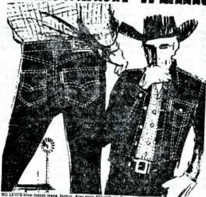
501 LEVI'S blue denim (WASH, button). Also style 502 with zip fly.