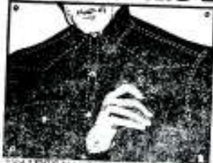
504 LEVI'S blue denim western shirt.

The Old West worked hard — and lived hard. Horses, Indians, Rustlers, Law. Today it moves peacefully on wings, wheels, rotor blades. Only LEVI'S jeans have stood the changing strains of Western life since 1850 — all over the world.