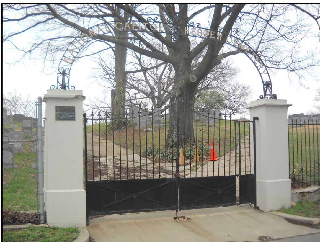
National Capitol Hebrew Cemetery, Maryland, U.S.A. ©Charles Polinger. See article on page 1.

View the full Program here < http://tinyurl.com/y3nprau >.