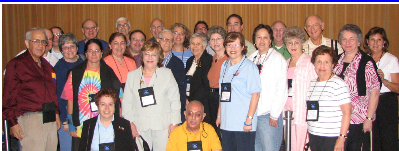
Between lectures, "some" members of the JGSGW were able to get together... Submitted by Ben Okner.