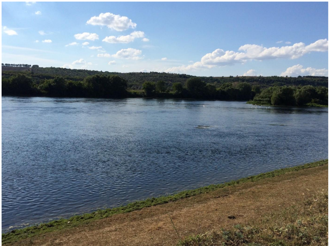
Dniester River near the cemetery

Not far away you can see Dniester River.