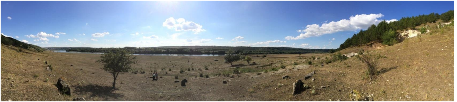
Panorama of remains of the Lyublin Jewish Cemetery

Not far away you can see Dniester River.