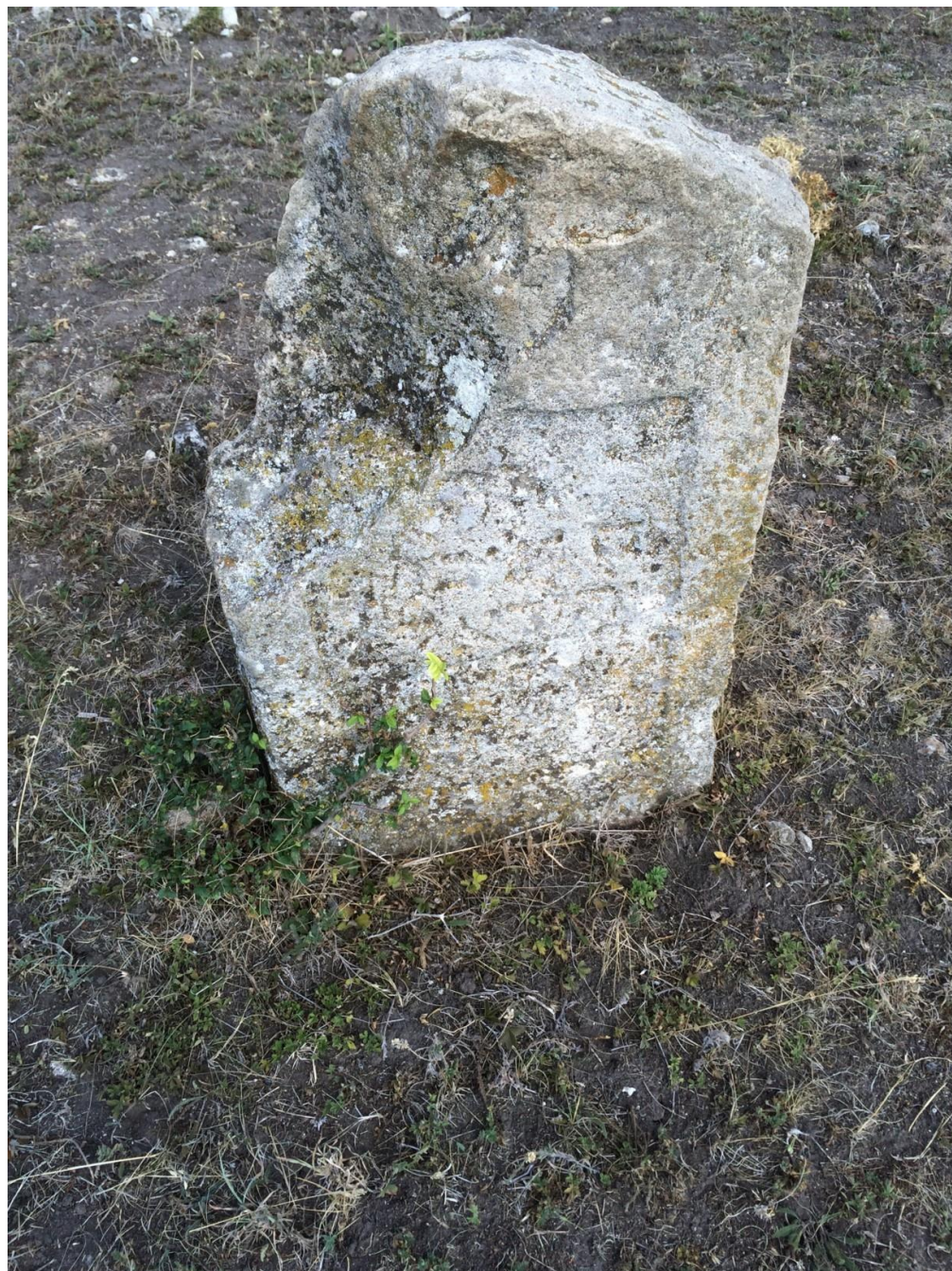
Second standing tombstone at the Lyublin Jewish Cemetery