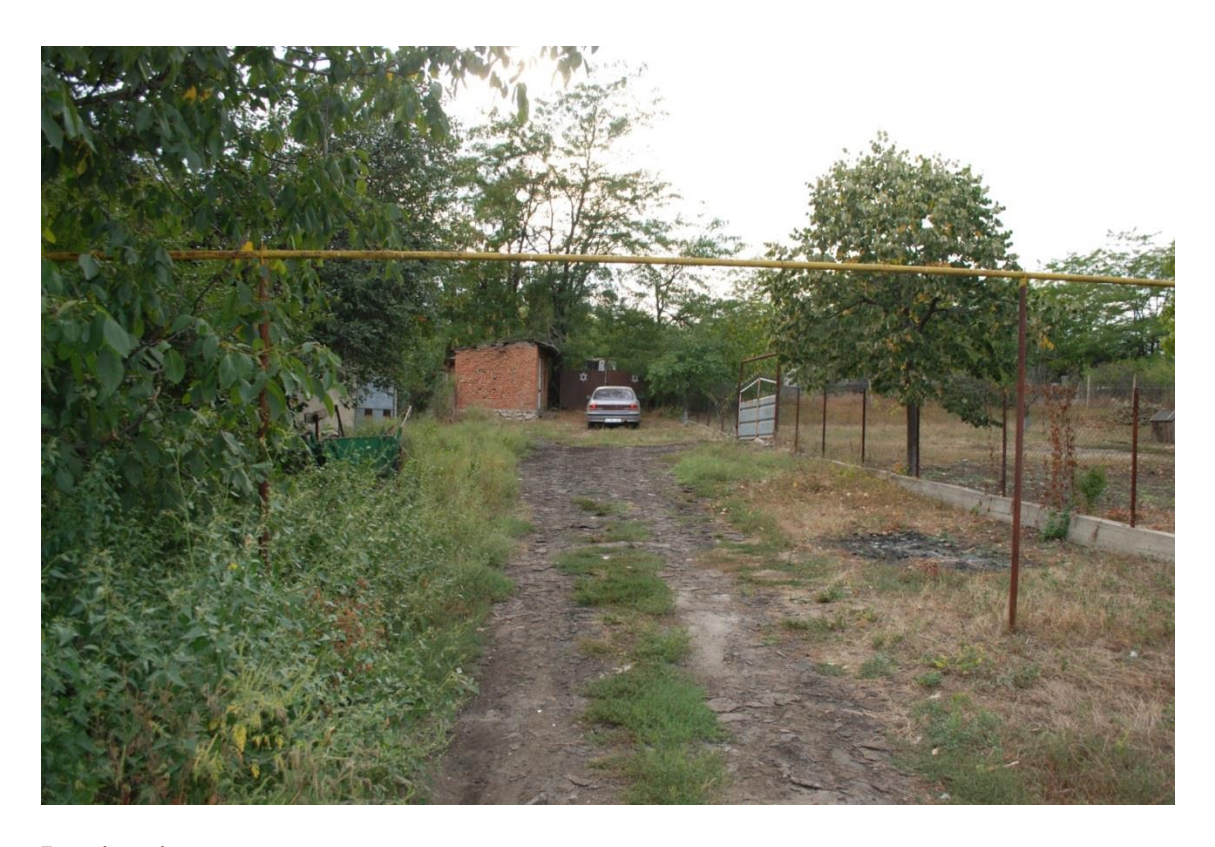
Road to the cemetery gates