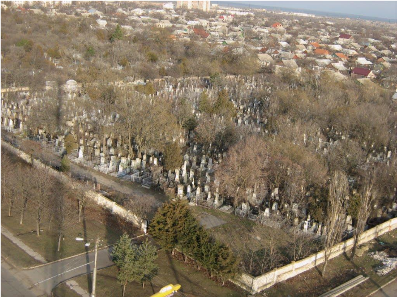
An aerial view on Tiraspol Jewish Cemetery.