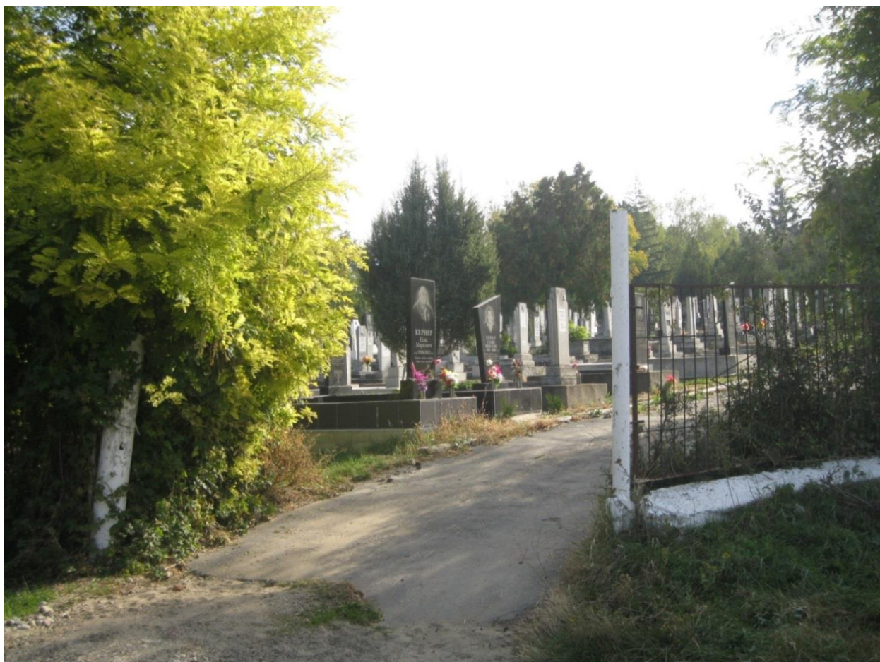
Gates to the Cemetery