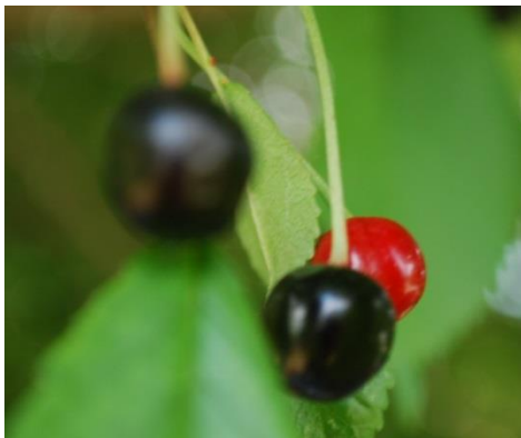
Cherries grow at the cemetery