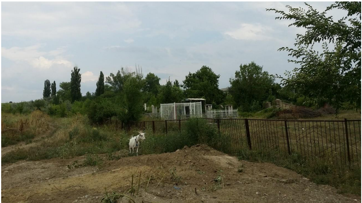
Part of the fence at the cemetery