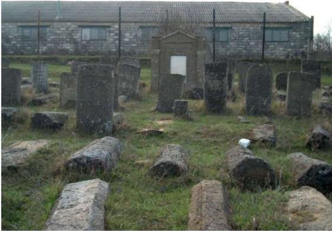
Photo of Leovo cemetery from the report “ Jewish Heritage Sites and Monuments in Moldova ”, United States Commission for the Preservation of America’s Heritage Abroad, 2010

According to the report “ Jewish Heritage Sites and Monuments in Moldova ”, created by United States Commission for the Preservation of America’s Heritage Abroad, 2010, The 1,500 square meter area of the Jewish cemetery in Leova is surrounded by a fence with a gate. There are more than 1,000 extant gravestones; the oldest from the 17th century. More than half of the stones are broken or toppled and vegetation overgrowth prevents easy access. There is no caretaker and the cemetery is rarely visited.