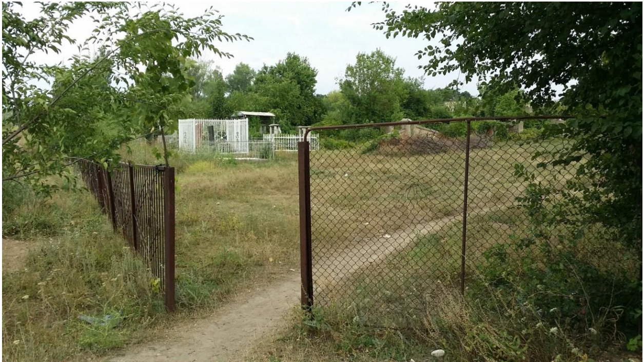
Gates to the cemetery