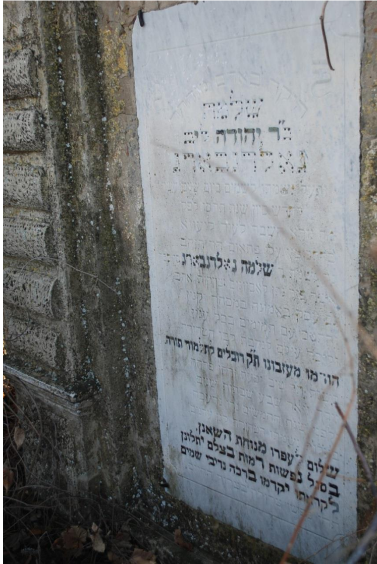
Monument of well-known resident of Leovo