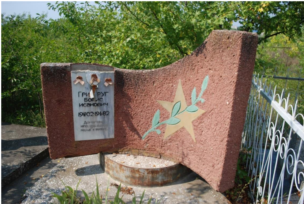
Monument of a Great Patriotic War Hero