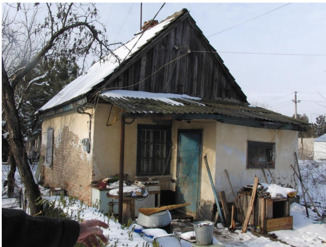
House of Vasiliy and Svetland, the caretakers of the cemetery

The Ismail Jewish Cemetery was completely indexed and photographed at the end of 2014.