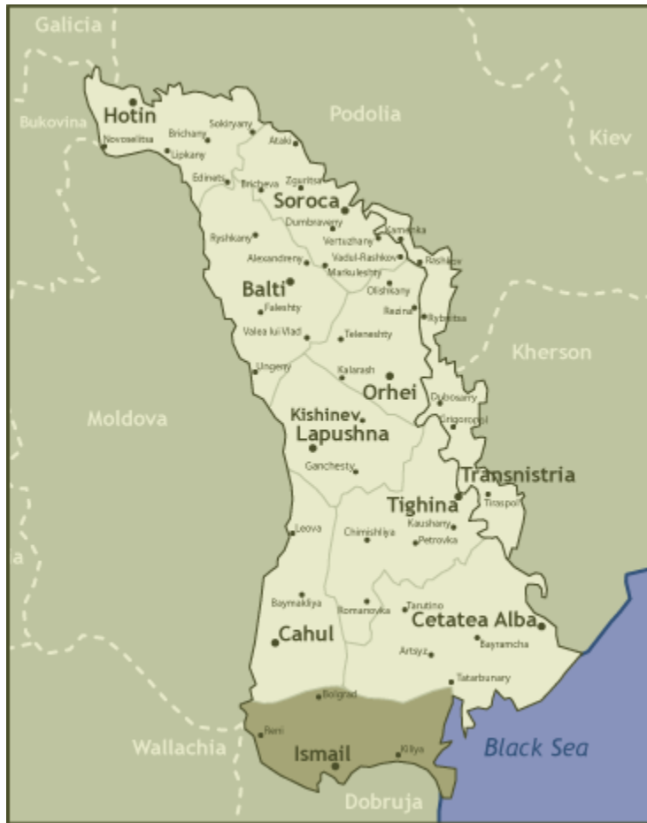
Ismail at the map of Bessarabia (south section). In brown you see Ismail uezd, district as of 1900.

In the 1960s there was an old Jewish cemetery located in the center of Ismail, at the place which now is Khmelnitskiy Park.