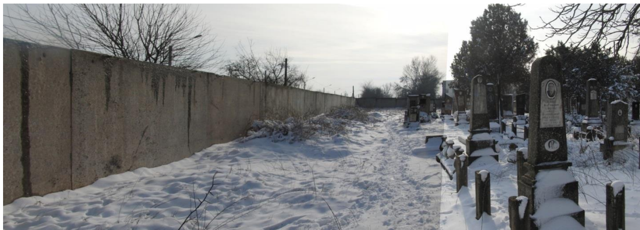
Wall of the cemetery.

In the 1960s there was an old Jewish cemetery located in the center of Ismail, at the place which now is Khmelnitskiy Park.