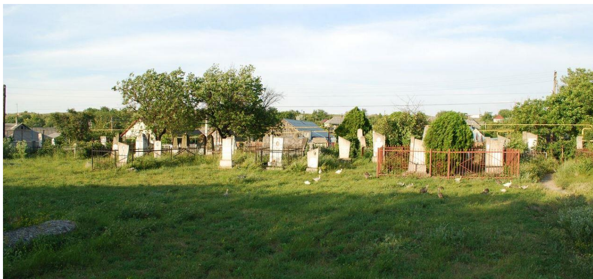
Cemetery view from adjacent field