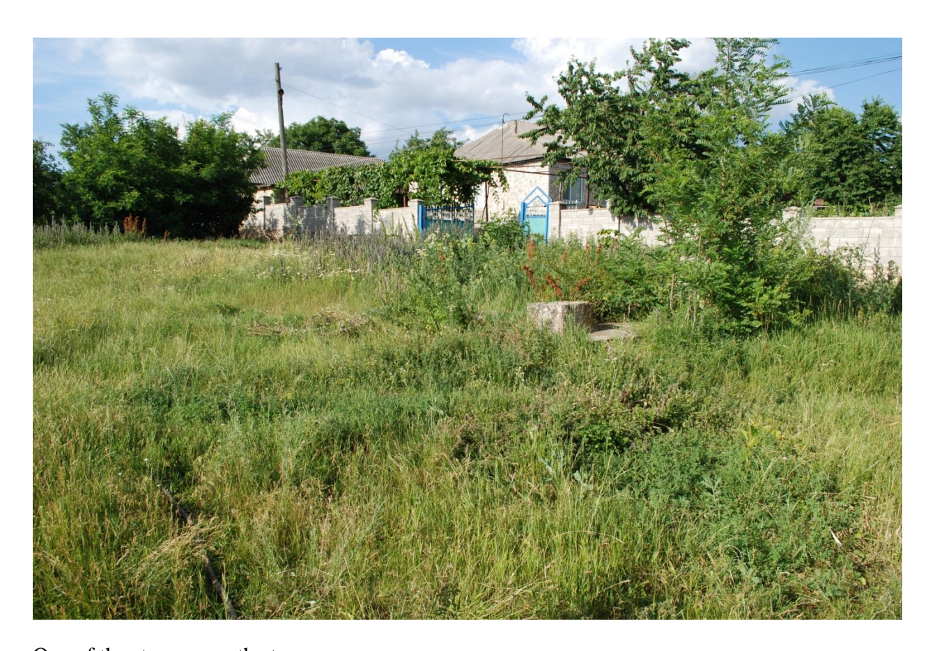
One of the stones near the tree