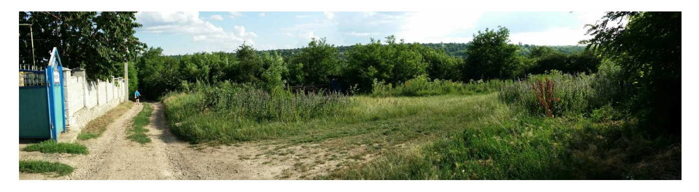
Field where the tombstones found