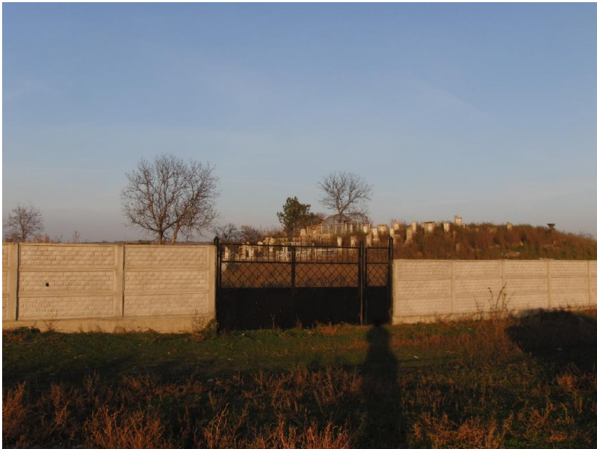
Gates to the Cemetery 2013, Serghey Daniliuk