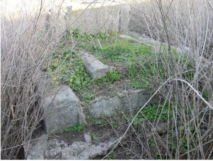
Grave of a Rabbi (no inscription), 2013, Serghey Daniliuk