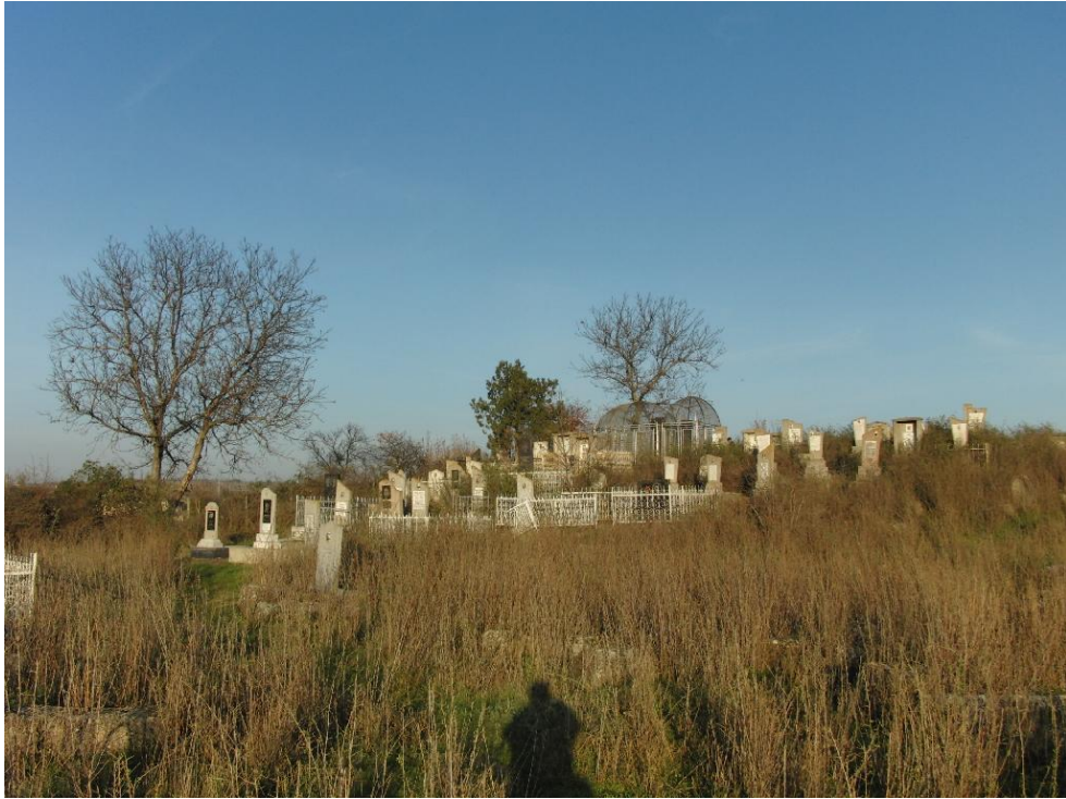
The overview of the cemetery