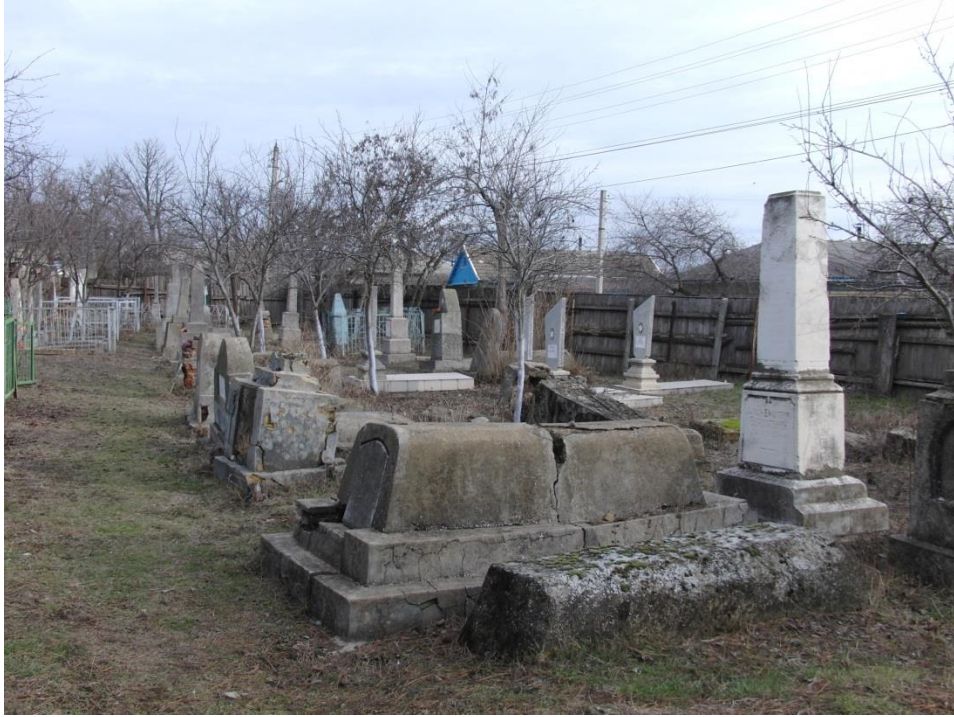
At the cemetery