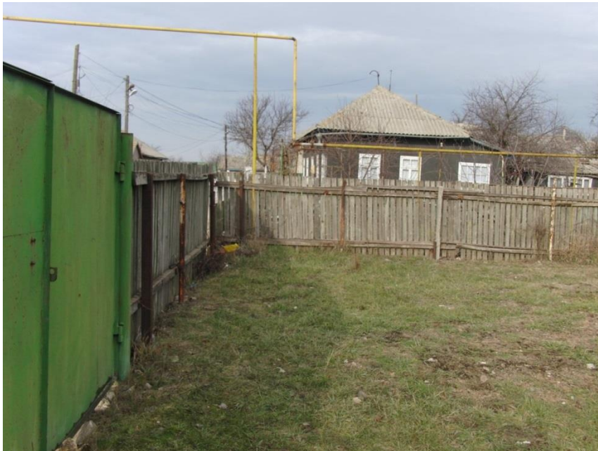
The corner of the cemetery 2014, Serghey Daniliuk