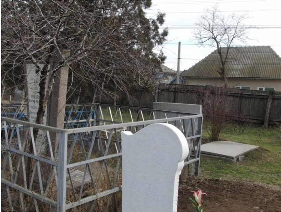
At the cemetery