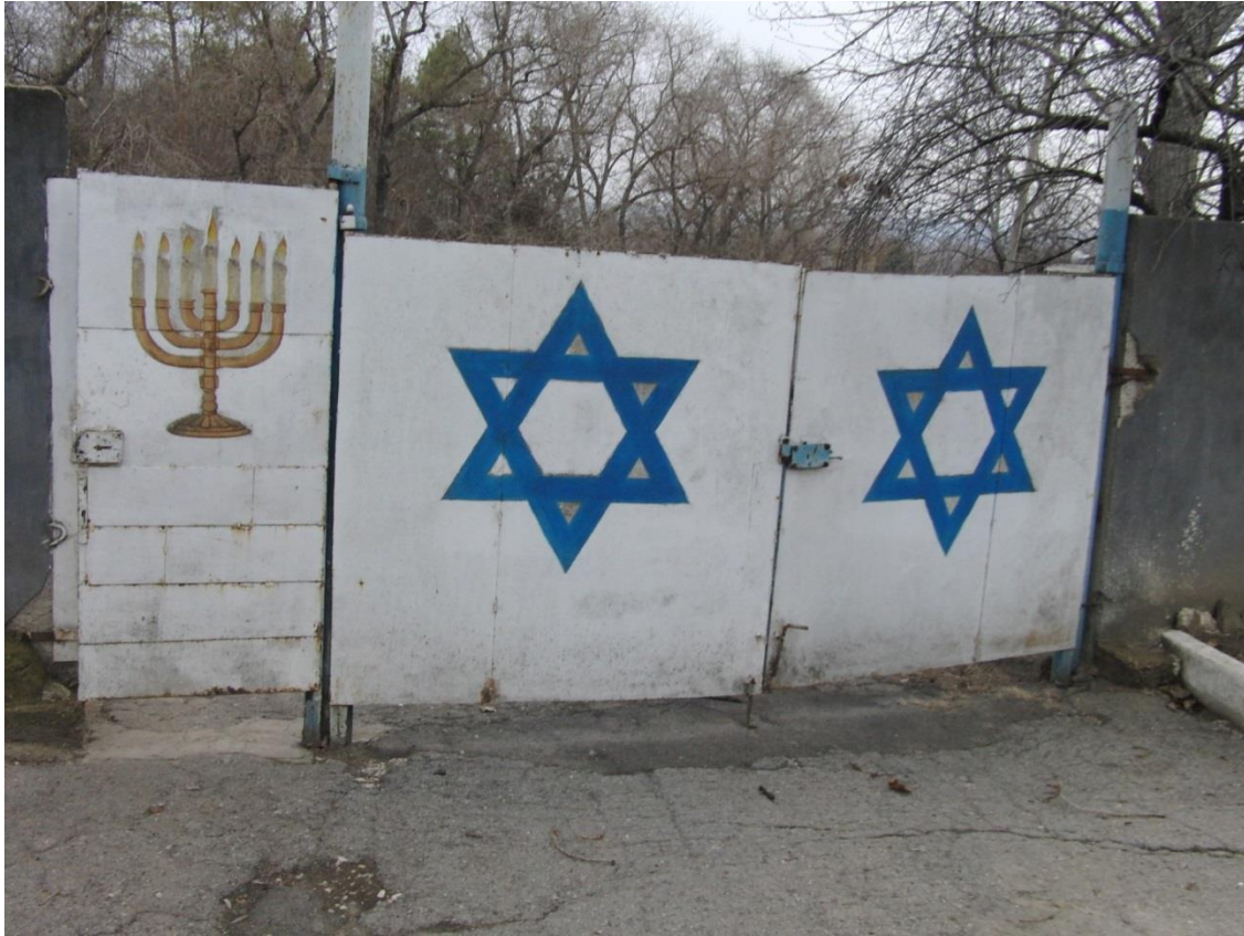
The view of the gates from inside the cemetery.