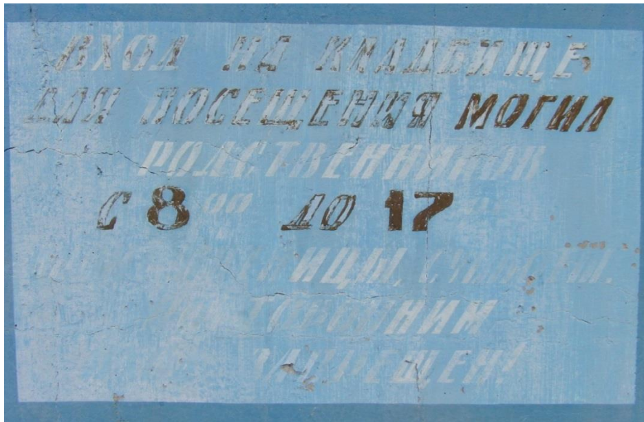
Announcement near the gate of the cemetery:

Entrance to the cemetery to visit the graves by relatives