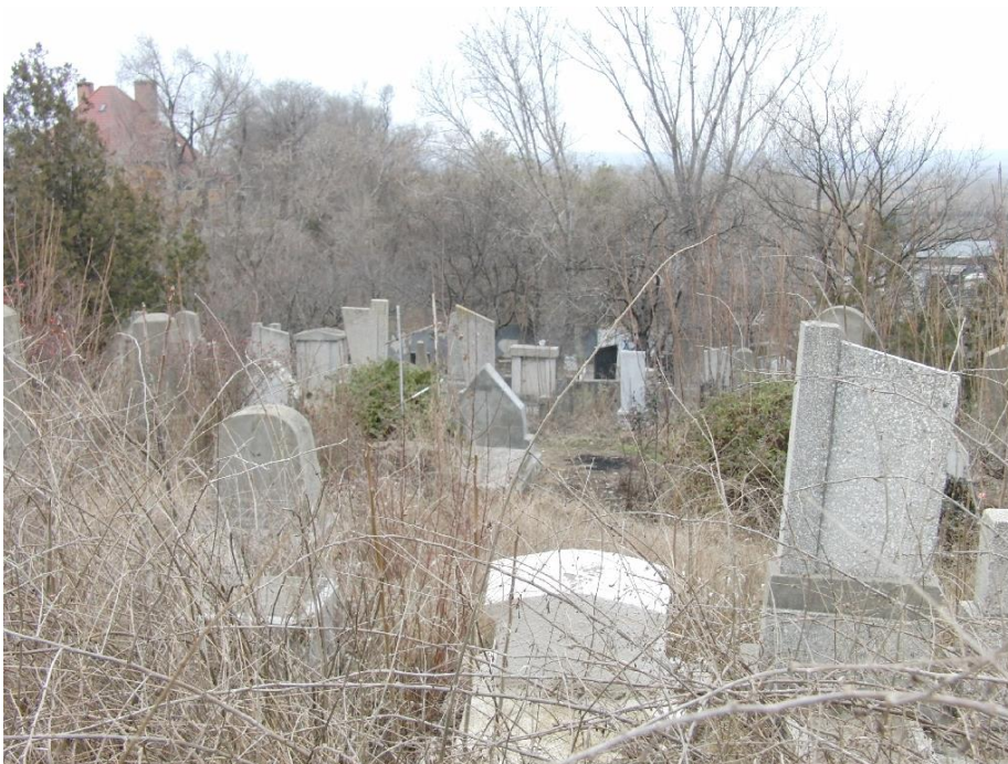
Part of the cemetery