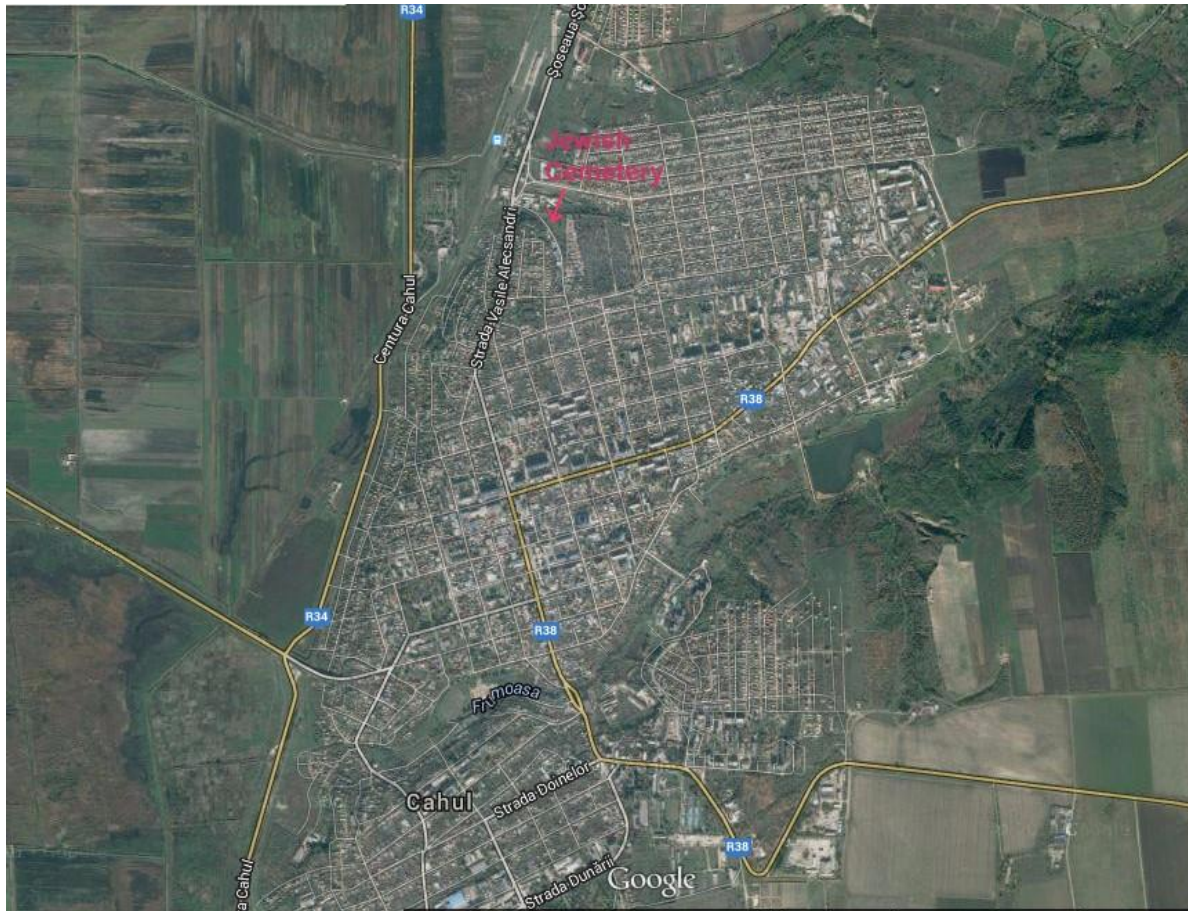
Jewish Cemetery at the map of town Kagul, Strada Vasile Stroiescu (Google Map)