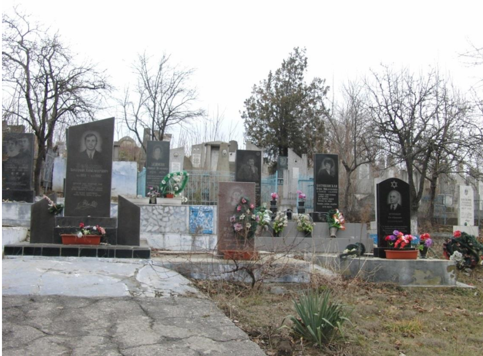
View in the new part of the cemetery