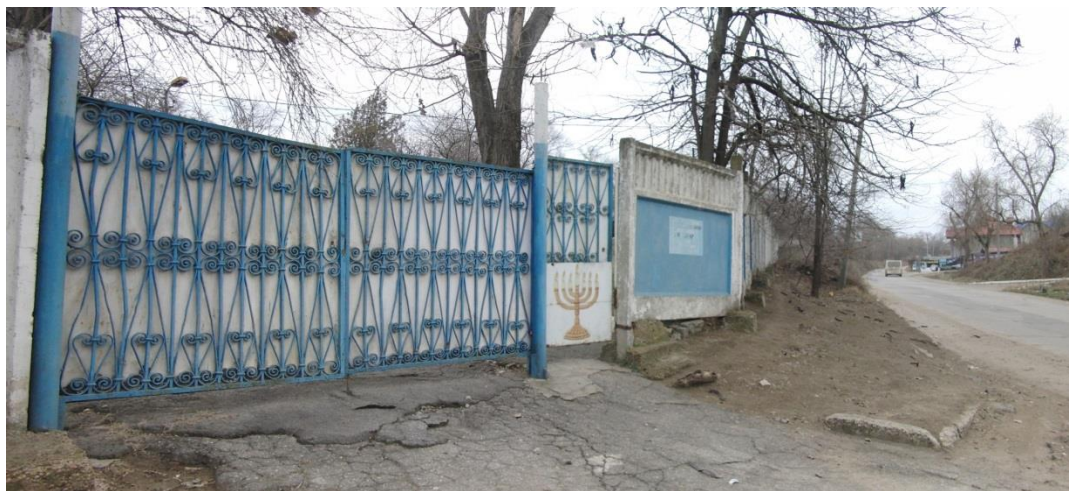
The gate of the Kagul Jewish cemetery