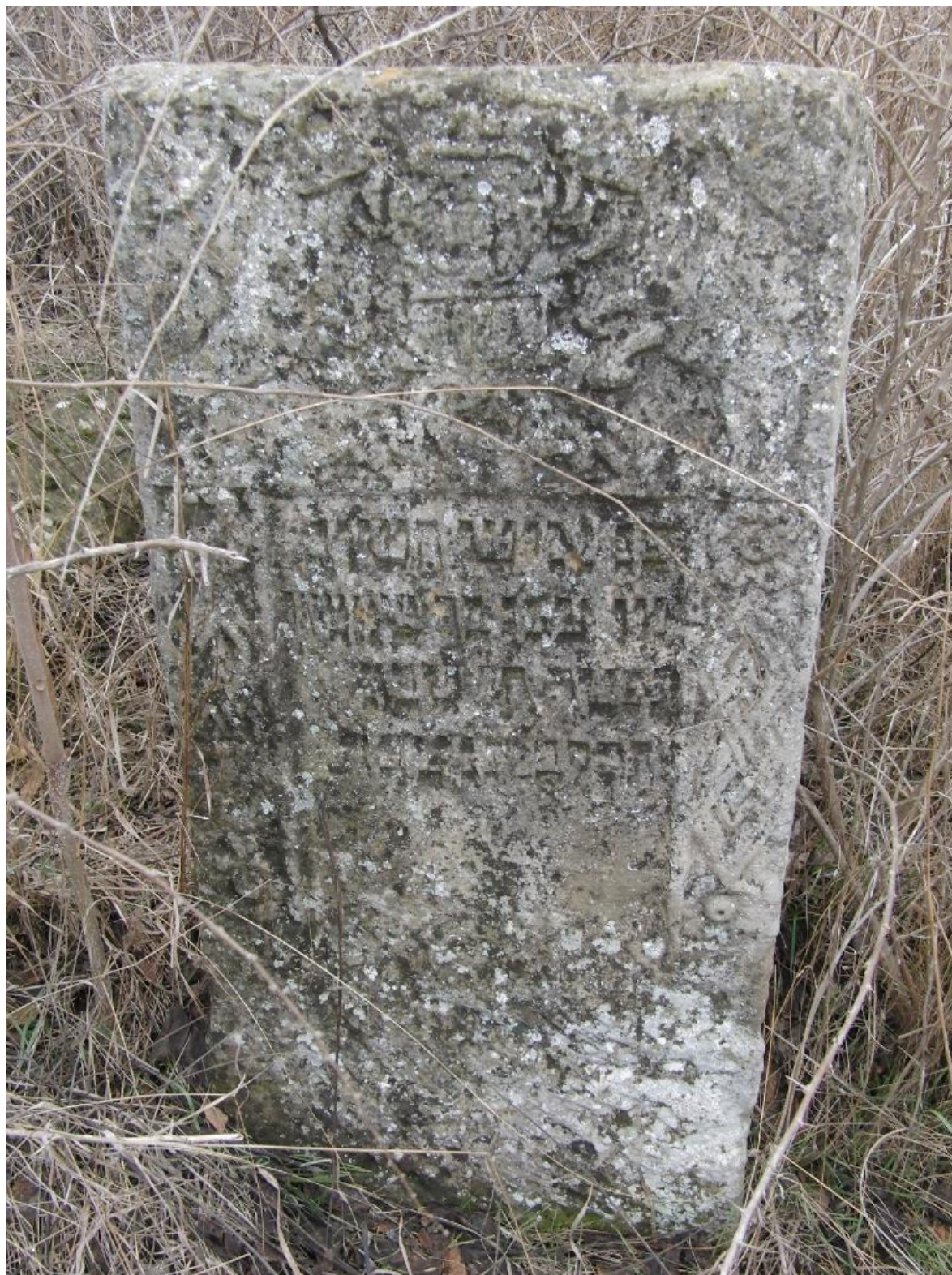
Grave from 1871!