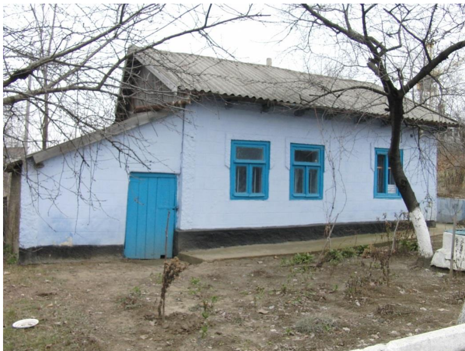
The caretaker's House at the cemetery.