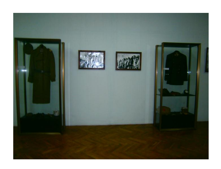
Photo 3. Exhibition »Soviet Moldova: Between Myths and the Gulag «