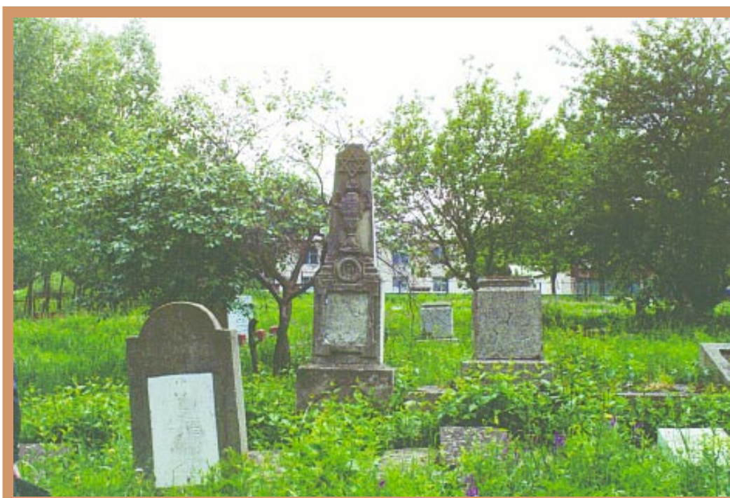
Jewish cemetery, 1992