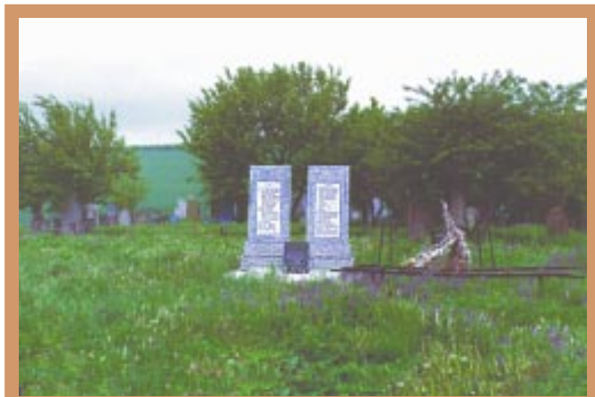
■ Holocaust memorial in the Jewish cemetery, 1992