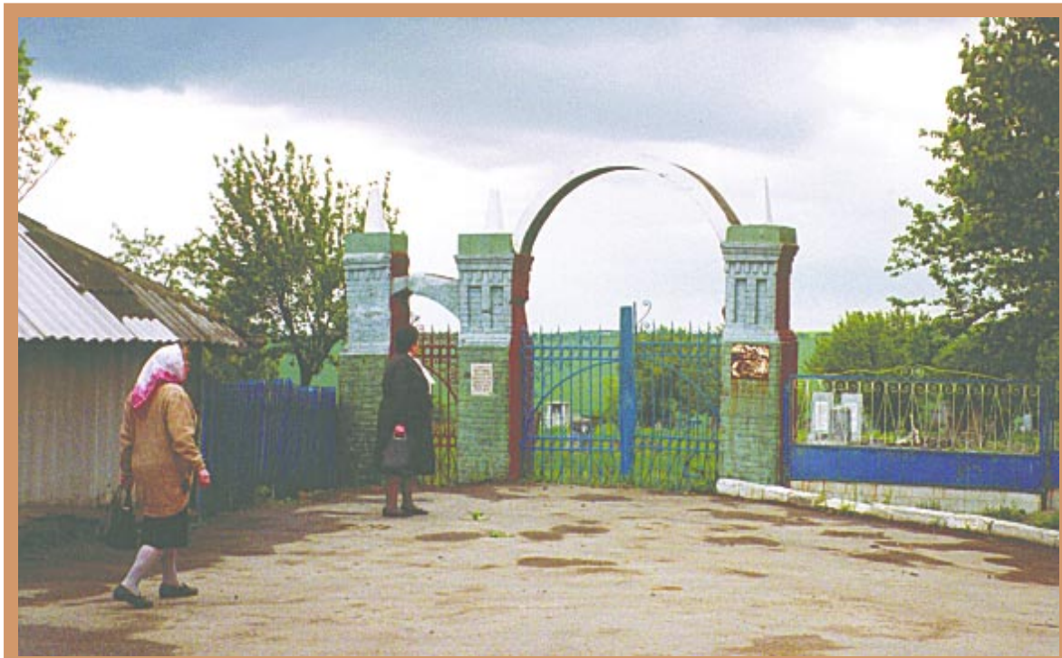
Entrance to Jewish cemetery, 1992