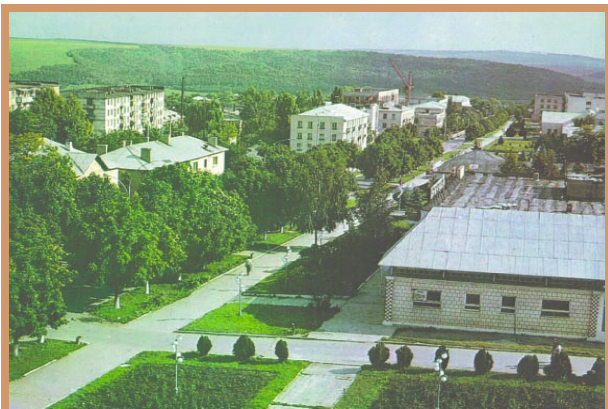
■ Town view, c. 1985