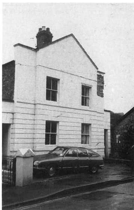
The former Stroud Synagogue, Lansdown