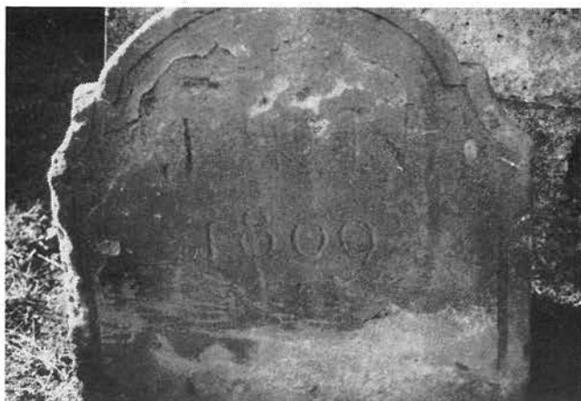
The earliest surviving Gloucester Headstone — J N 1809