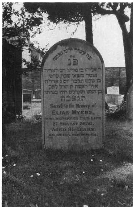
Headstone in Cheltenham Jews' Burial Ground; Elias Myers, died 1870