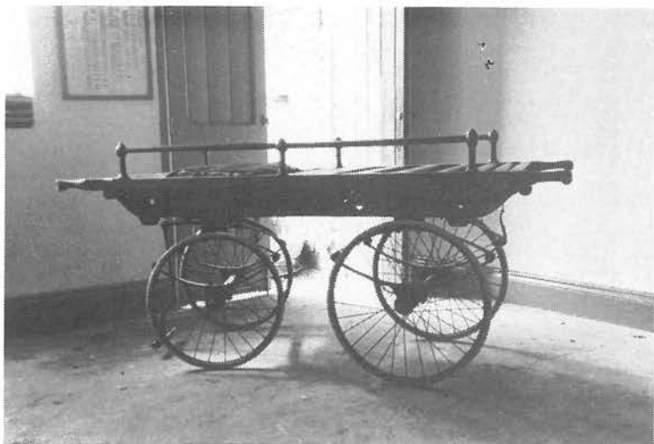
The Hearse in the Watch House, Cheltenham Jews' Burial Ground. On the wall is a Grave Plan of the Burial Ground