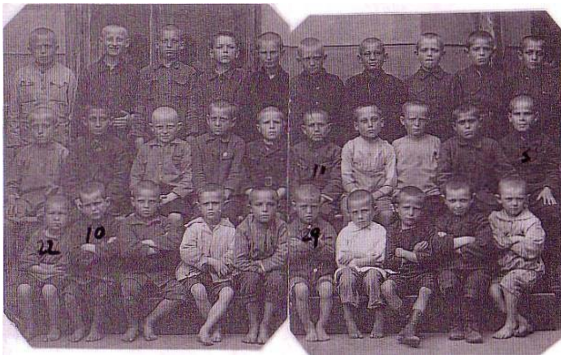
Passport photo of the Ochberg Orphans

I am continuing to collect their memories through the eyes of their children and when I have collected enough of their memories will put them in a separate book which will be a fitting memorial. I invite the children of Ochberg Orphans to contact me at sedsand@ca.com.au with their parent's stories.