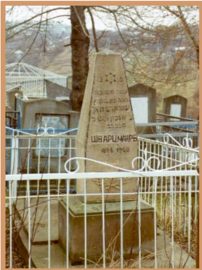
■ Tombstone of Rachel Schwartzman, 1875–1900 (photo, 1993)