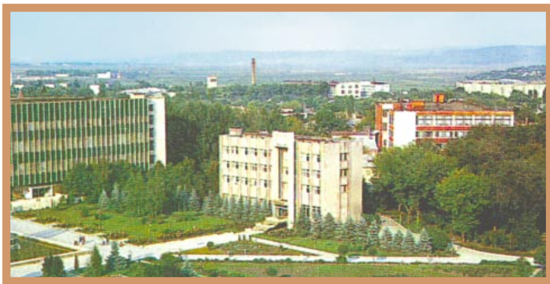
The center of town, c. 1990