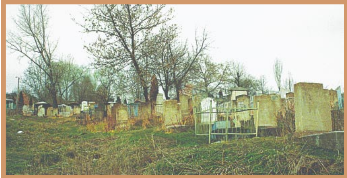
■ Jewish cemetery, 1993