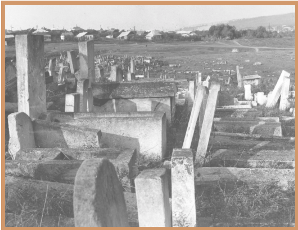
■ Jewish cemetery with tombstones dating from the late 19th century, 1966