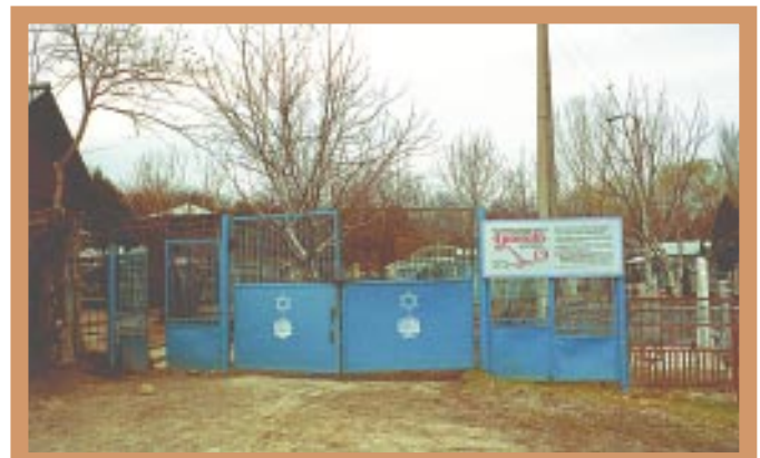
■ Entrance to Jewish cemetery, 1993