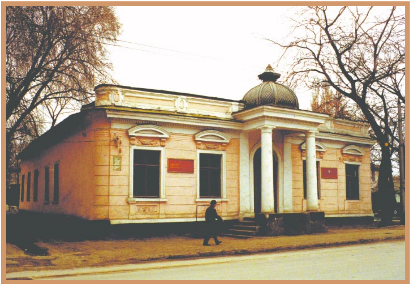
■ Former Jewish cultural center, 1993