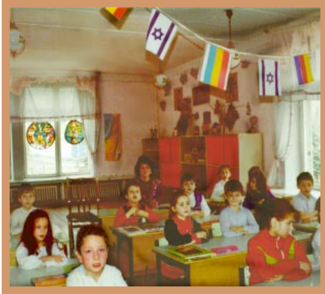
■ Jewish children learn in a Hebrew day school, 1993