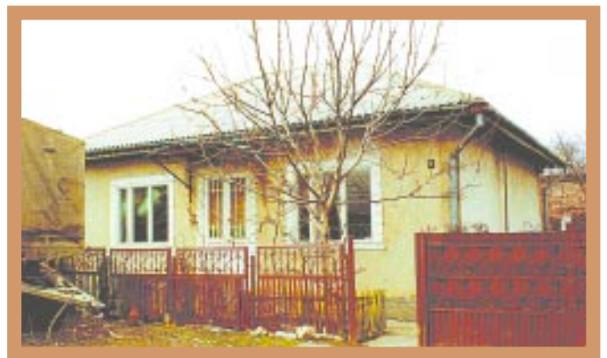
Only operating synagogue in Bălți, 1997

14,259 (46% of general population in 1930)