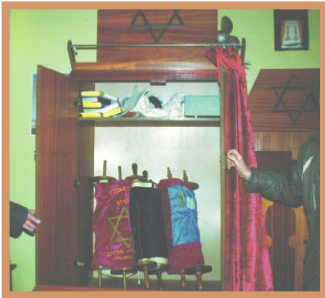
■ In the Beltsy Synagogue, 1993