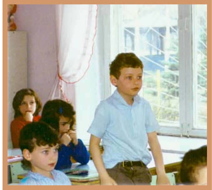
■ A Jewish boy recites in Hebrew, 1993